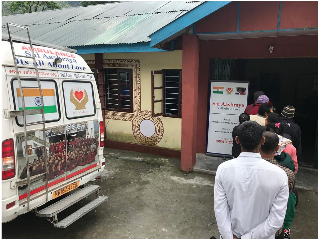
Patients queue up outside our venue in Zemithang....

patients that they had lunch. Our cardiologist had his lunch only after all of us had finished refuelling!