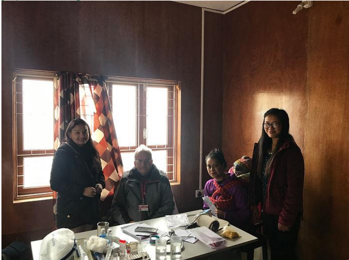
The nursing staff from Kitpi PHC assisting one of our Doctors in the Tawang Monastery & Surrounding Villages Medicare Camp....

Over the 4 days of Blissful Seva, 550 patients had been treated. So far, 40,000 lives have been touched by Sai Aashraya's holistic Medicare initiative. Sai Aashraya's Gram Seva is gaining momentum and will be expanding further in August 2019, with some more initiatives that will eventually shape all the future service projects in this region.