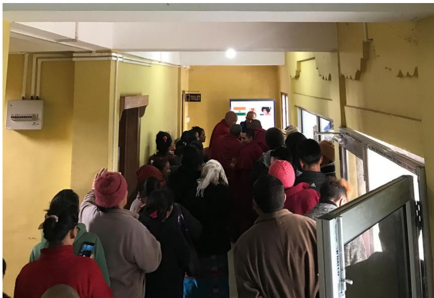
At Sai Ashraya Medicare Camp In The Tawang Monastery...

After two challenging days of Seva, we were having good momentum and just wanted to keep the high energy levels going. As we started after breakfast that morning, we again had our doubts about how the Seva would go on in such a heavy downpour. The visibility was bad and thankfully the distance to the Monastery isn't that far. So, we reached there only to see all the Lamas (Elder Monks) waiting for us at the entrance. Even as we alighted from our vehicles, the Lamas helped us carry all our equipment. The staff of the Monastery helped us unload all our medicine trunks and we were all set in no time at all. A large number of people were waiting at the dispensary in the Monastery already. The Doctors came in and got to work straight away. The Elder Monks were the first to be seen. Their health had improved a lot and it was wonderful to see them again. Their presence has a calming influence on everyone around. Even as the people from all the nearby villages came in, the weather just got worse. They had made it just in time somehow. There were patients who had travelled 3 -4 hours to reach the venue. Once again, all the old patients showed good improvement. Even heart patients had recovered considerably. In some cases, the improvement was nothing short of being miraculous.