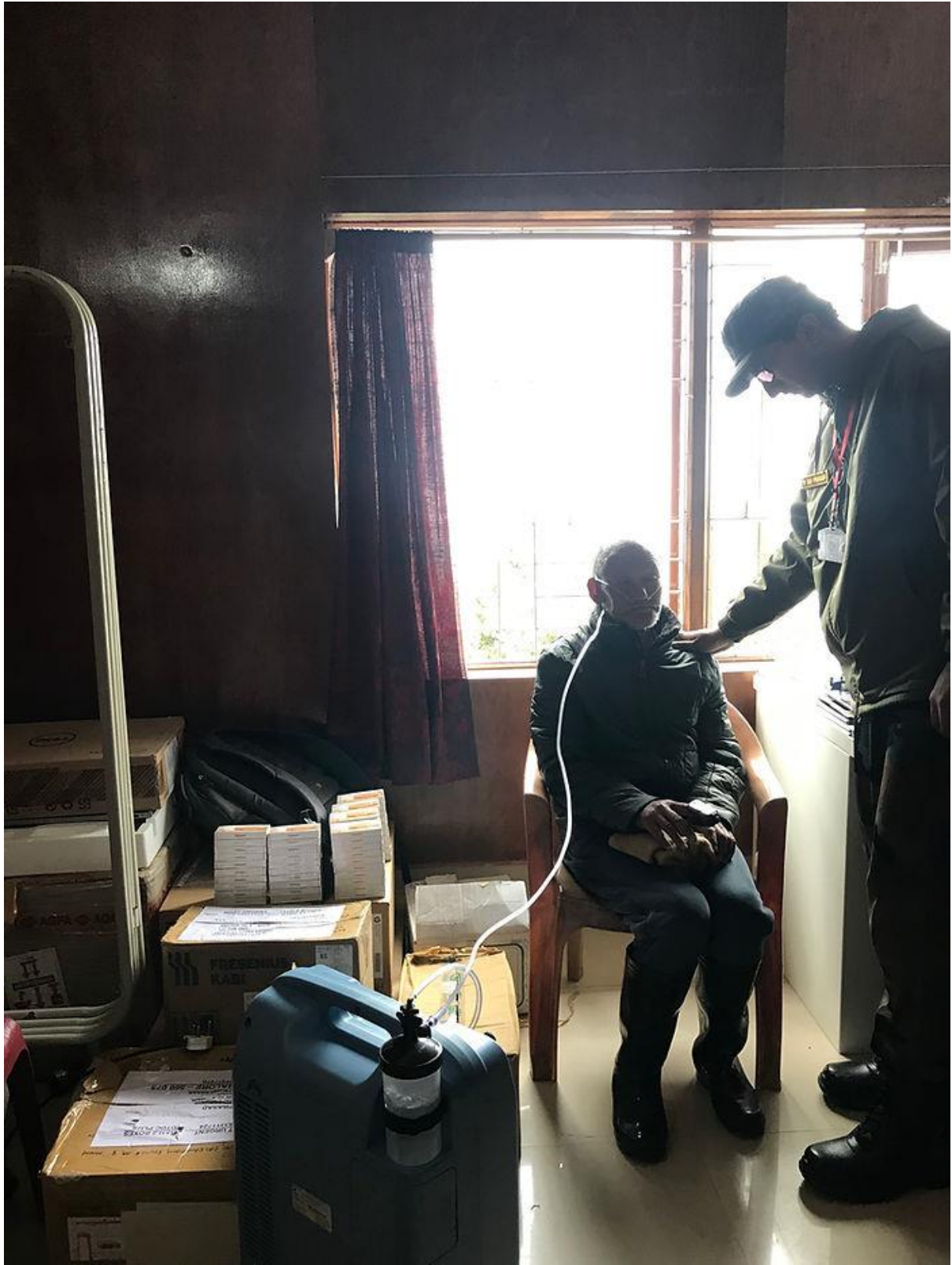
Oxygen therapy in progress....

The Younger Monks came in making the whole atmosphere feel vibrant with their energy. There were more cases of fungal skin infections this time. After the Young Monks were treated, a discussion took place between Sai Ashraya's volunteers and the Elder Monks about how to curb the spread of skin infection. A plan was made