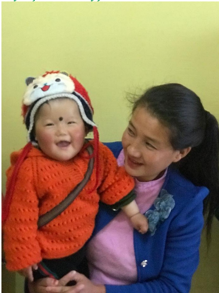
One of the little ones lighting up our hearts with a lovely smile....