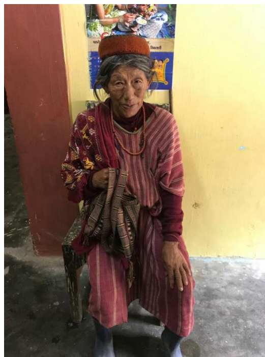
One of our old patients. Do you remember her from the previous blogs? She is a true inspiration....