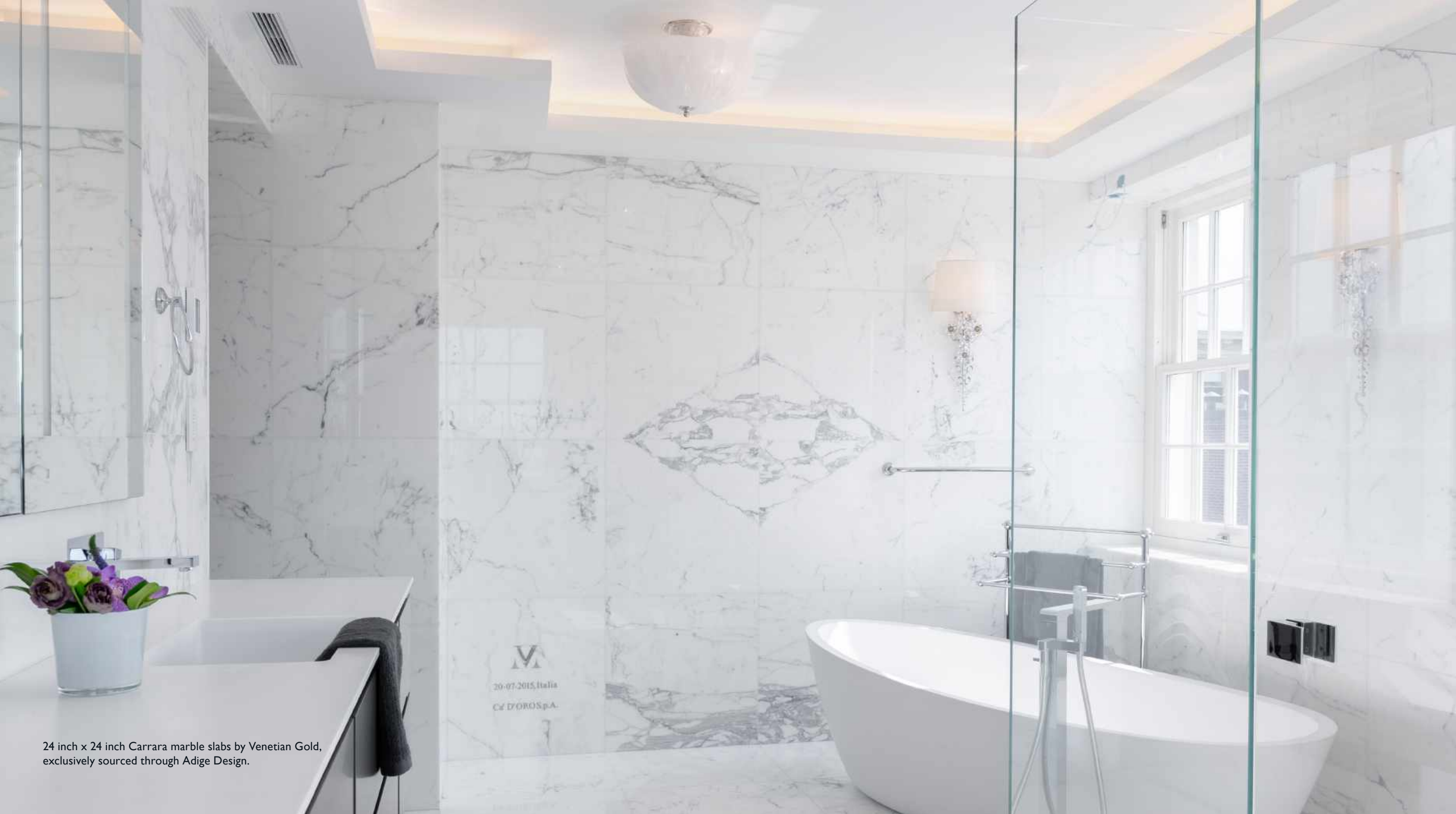
24 inch x 24 inch Carrara marble slabs by Venetian Gold, exclusively sourced through Adige Design.