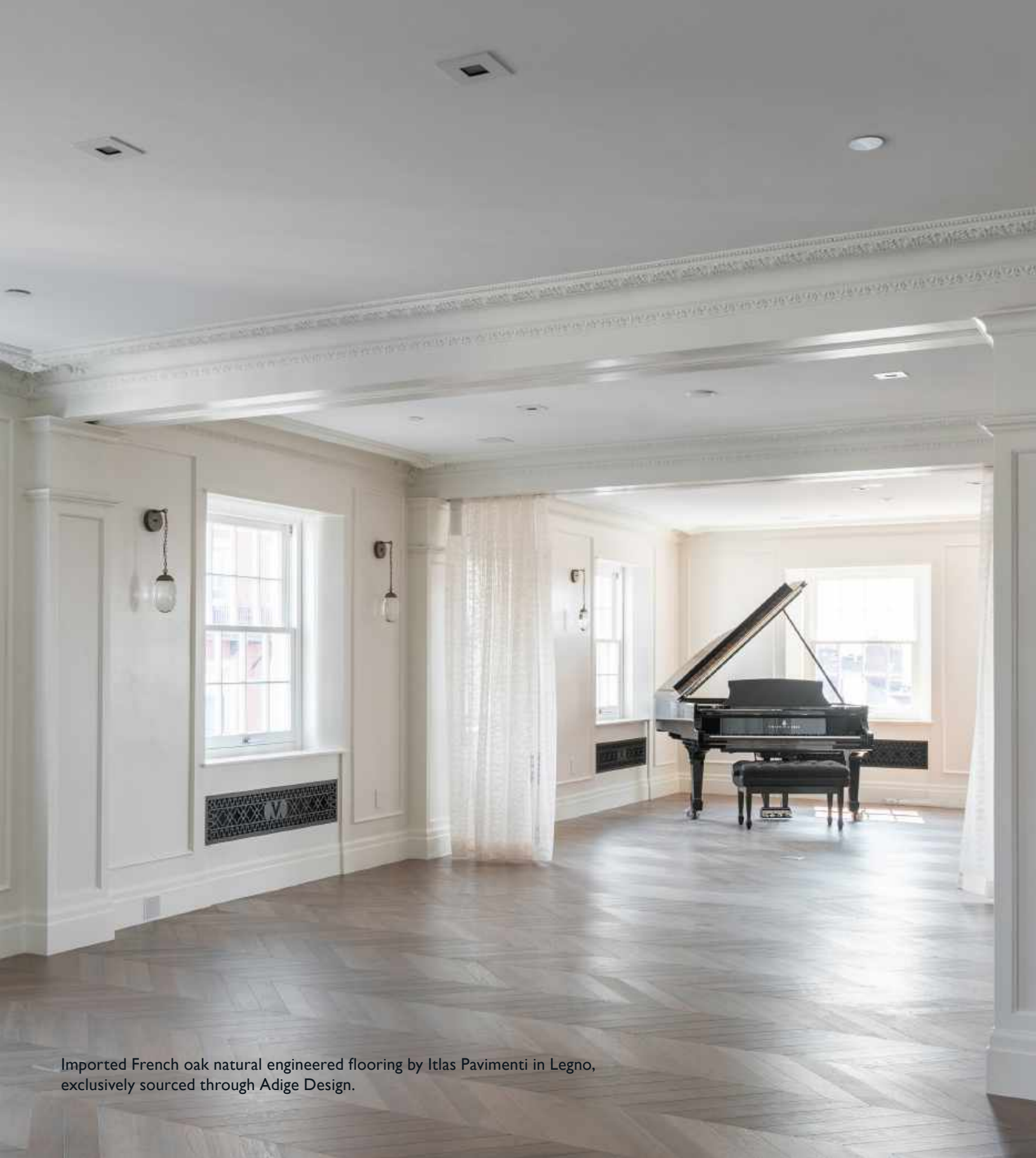
Imported French oak natural engineered flooring by Itlas Pavimenti in Legno, exclusively sourced through Adige Design.