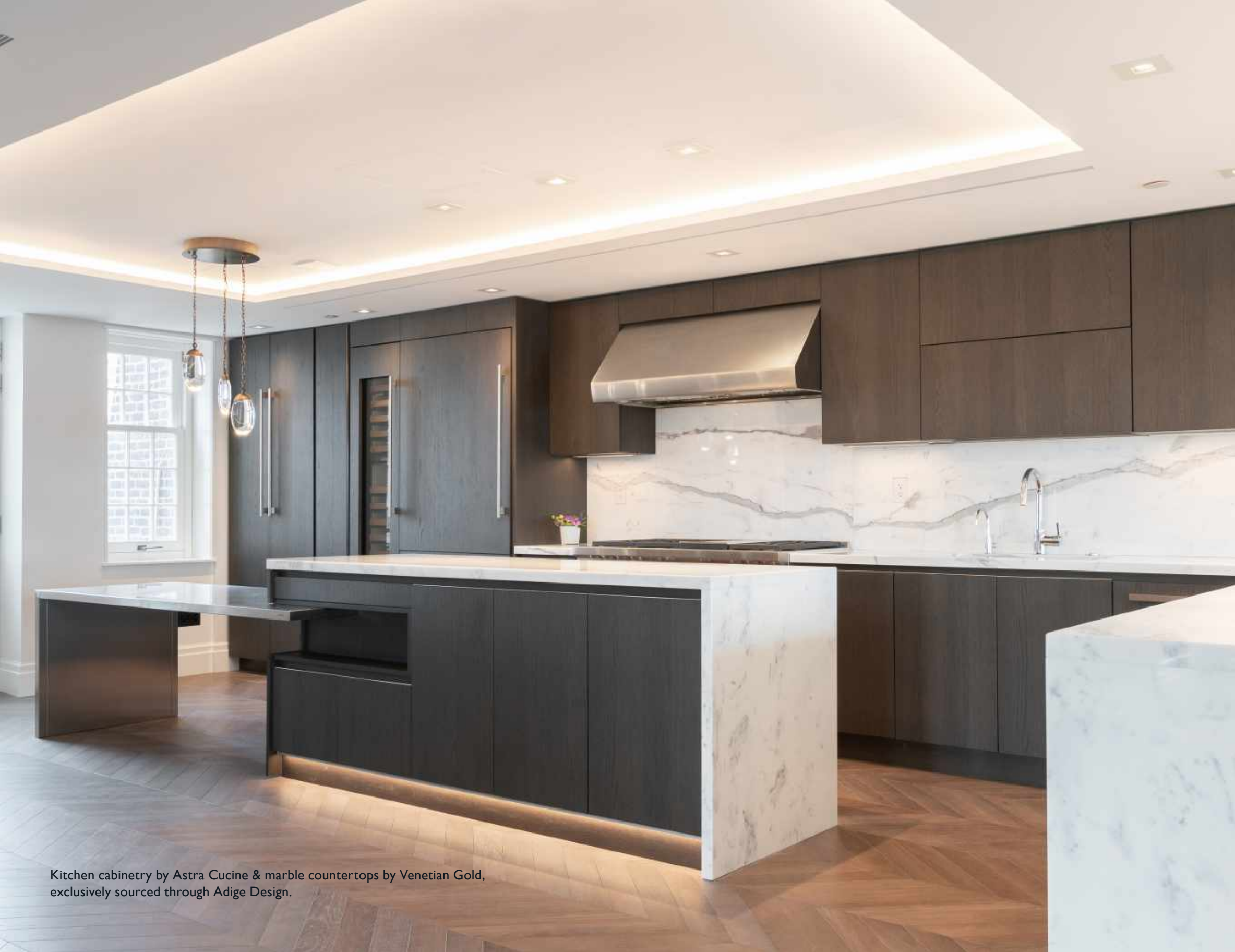
Kitchen cabinetry by Astra Cucine & marble countertops by Venetian Gold, exclusively sourced through Adige Design.