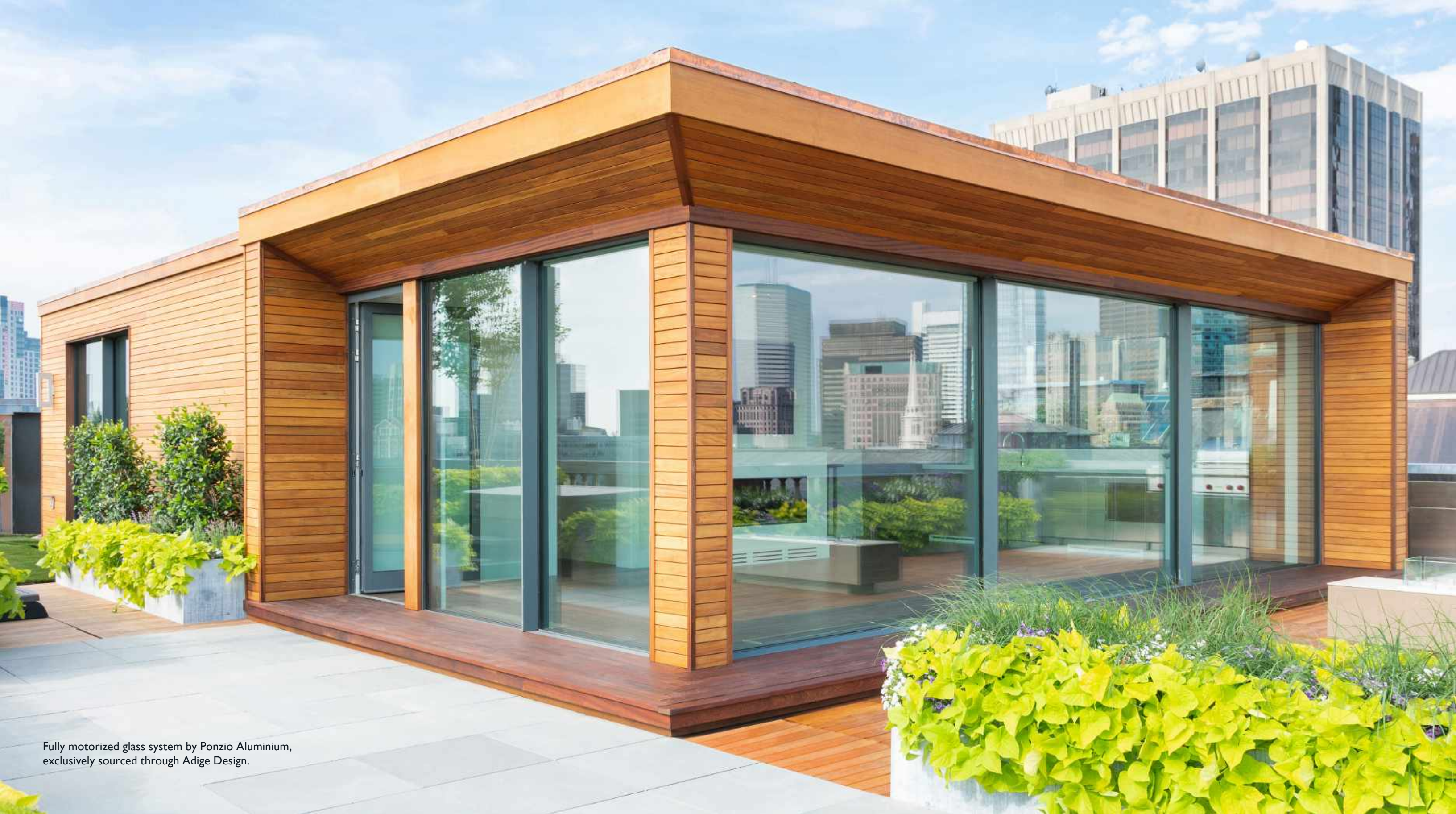
Fully motorized glass system by Ponzio Aluminium, exclusively sourced through Adige Design.