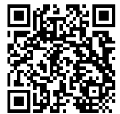
Read Aloud Video

Here is a little background information about our First Chapter Friday title and its creator. Feel free to add your own notes and thoughts in the bottom box.