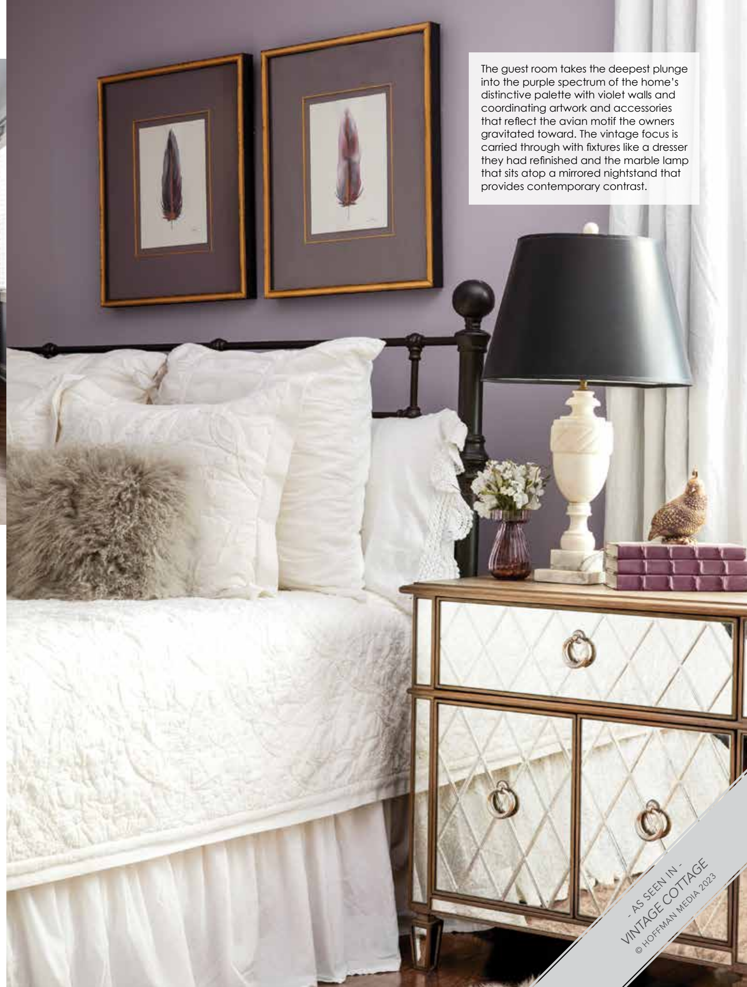
The guest room takes the deepest plunge into the purple spectrum of the home's distinctive palette with violet walls and coordinating artwork and accessories that reflect the avian motif the owners gravitated toward. The vintage focus is carried through with fixtures like a dresser they had refinished and the marble lamp that sits atop a mirrored nightstand that provides contemporary contrast.