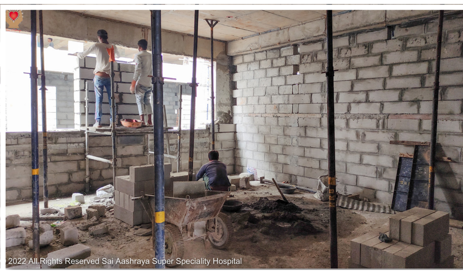
2022 All Rights Reserved Sai Aashraya Super Speciality Hospital

Many of the people who have come and visited the construction site have noticed the joy and enthusiasm with which all the staff go about their work. Some of them who have been in this field for long keep telling us that they have not seen a site like this. Dear Readers, we can only attribute this to one thing – Pure Love. All the staff are our family and we make sure that they are always at home. They keep telling us that they wish that we build many more such institutions and they take part in the construction. “Yeh Hoti hain Zindagi” “This is life” said one of them when he explained how his perception about life changed after coming to Sai Aashraya. He said