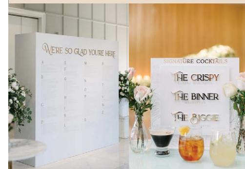
The couple's pup, Biggie, inspired one of three custom cocktails.