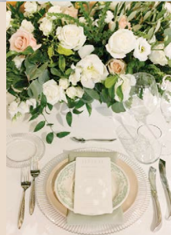
Each guest received their very own personalized menu and custom "CJ" drink tag.