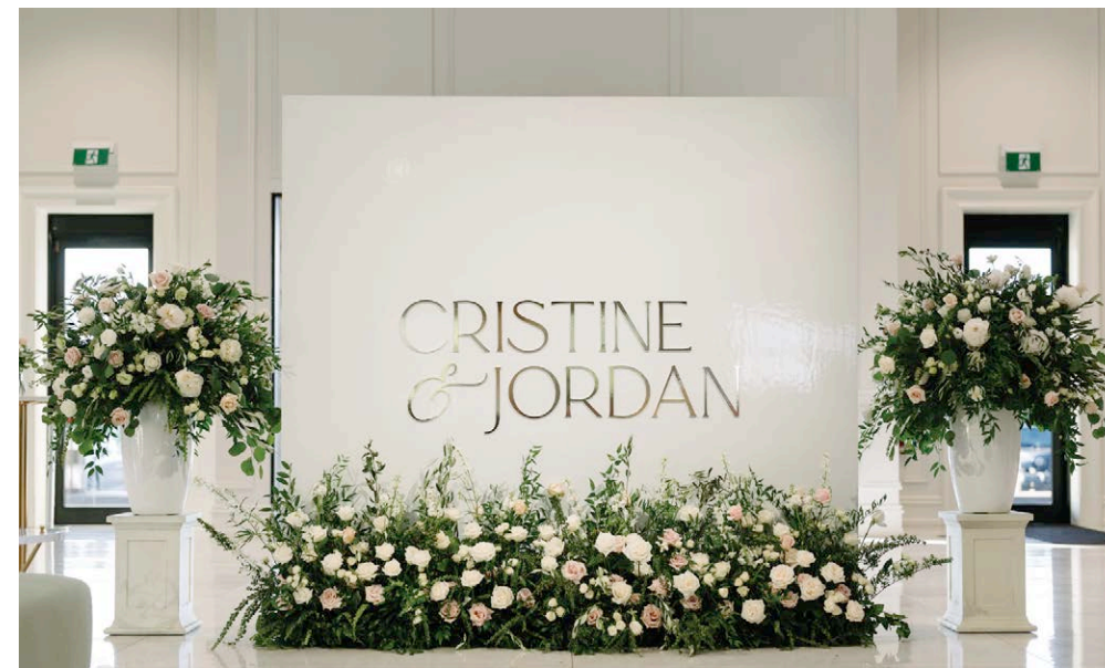
The oversized two-sided seating chart doubled as a backdrop for photo opps.