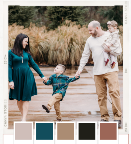
Palette #3 FESTIVE EMERALDS