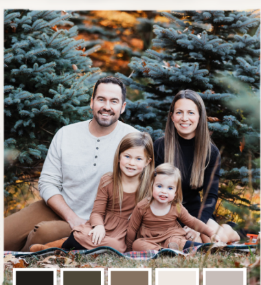
Palette #1 NEUTRALS

Rather than trying to match one color, opt for a color palette instead. Your color palette should include 4-5 colors. You want to pick these according to tones instead of just colors. Examples of tones can include earth tones, pastels, etc. If you already know your location, pay close attention to the colors represented there.