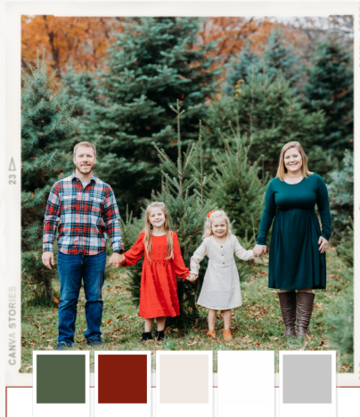
Palette #2 CLASSIC CHRISTMAS