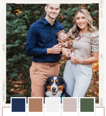
Palette #4 HOLIDAY GLAM