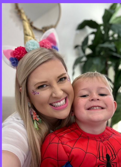
Ask your therapist about strategies and suggestions for preparing for trick-or-treating, festivals, and other seasonal activities!