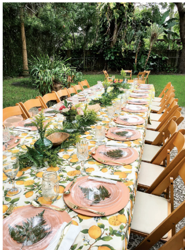
DATE BOOK