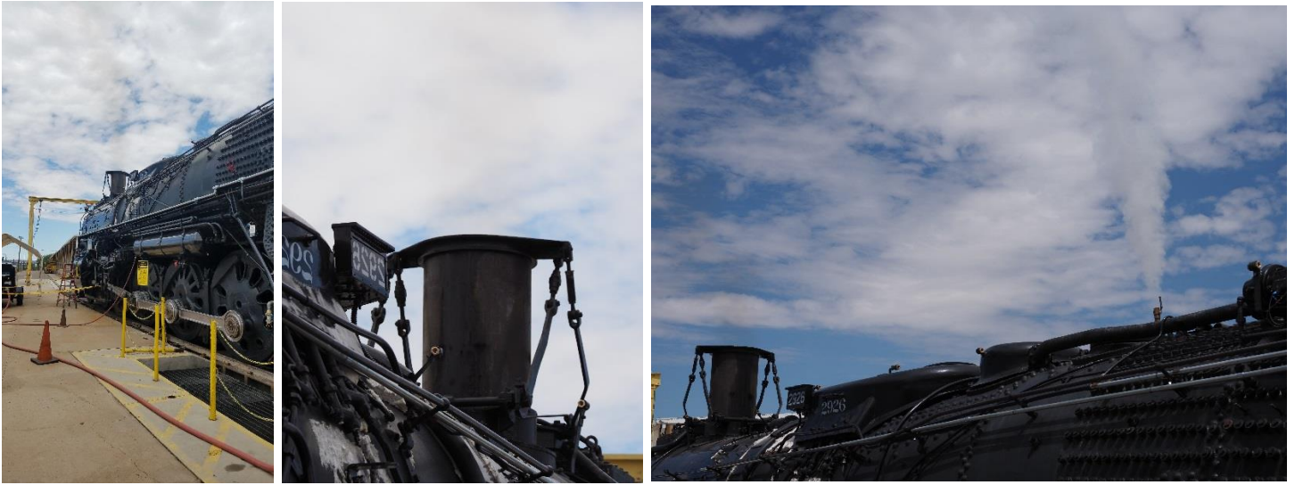
A thin gray haze rises from the extended stack. Venting steam at 195 degrees.

At 1305 and 70 psi in the boiler the fire was killed, the air compressor disconnected, and Henry opened the root valve. The fire restarted with the atomizer and blower running on steam. At 1350 the boiler was at 100psi and 335 degrees F. At 1400 the pressure was 150 psi and the injector was successfully cycled. Planning on the first safety valve lifting at 290psi the crew was surprised at 1500 when the first safety lifted at 265 psi. Multiple attempts to adjust it were not successful. CMO Kirby decided that fixing the safety valve(s) will wait for another day.