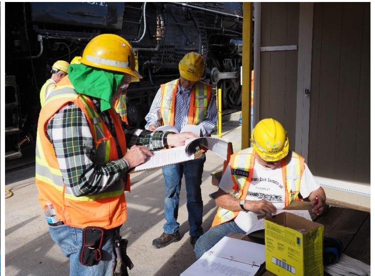
Sign your work