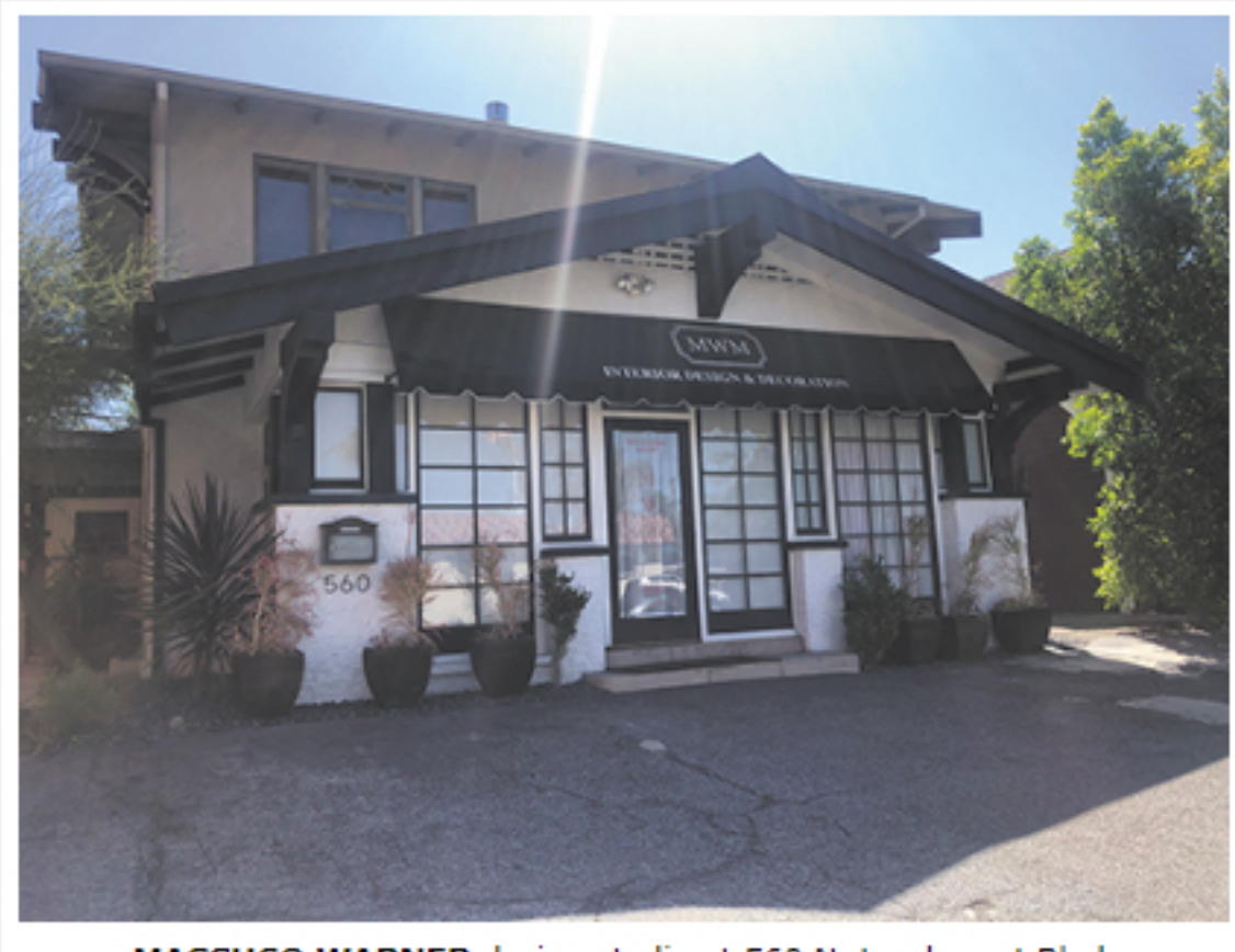
MASSUCCO WARNER design studio at 560 N. Larchmont Blvd.