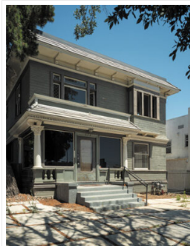
STUDIO AR&D REMODELED the building at 424 N. Larchmont Blvd., above. Notice the giant window in the remodeled building, at right.