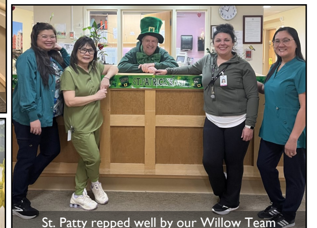
St. Patty repped well by our Willow Team