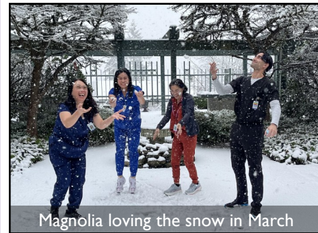
Magnolia loving the snow in March