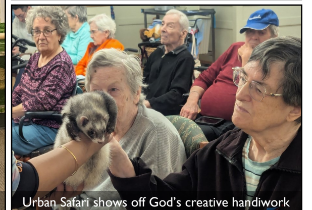
Urban Safari shows off God's creative handiwork