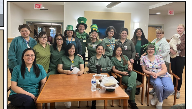
Our very experienced staff looking a little "green"!