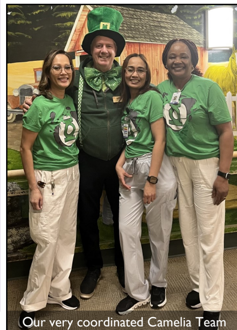
Our very coordinated Camelia Team