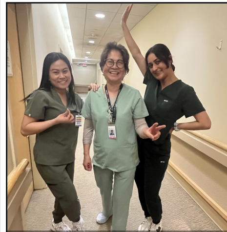
Now that's "getting your green on"!