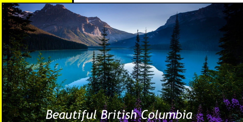
Beautiful British Columbia

We live in a beautiful part of the world and we serve a good God who created all that we see - let’s make the most of every moment.