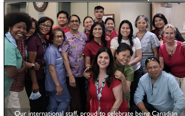
Our international staff, proud to celebrate being Canadian