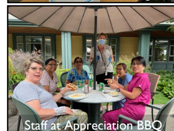
Staff at Appreciation BBQ