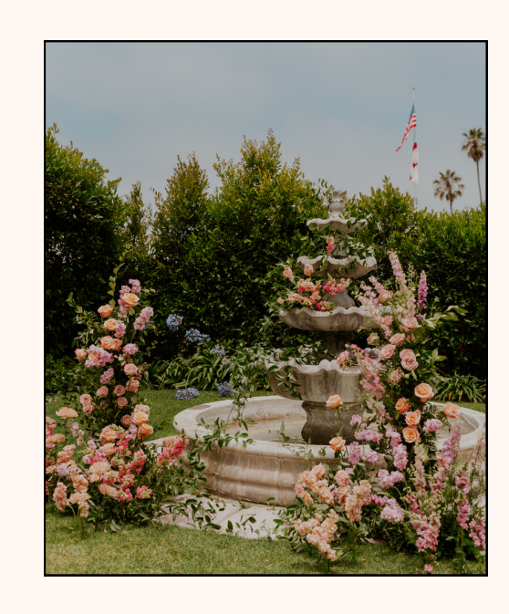
LA JOLLA WOMEN'S CLUB LA JOLLA, CA