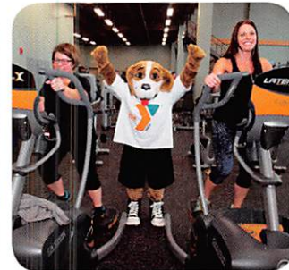
Guests sign up for memberships (left) and members pose with Y-Doh during Open House Weekend (right)