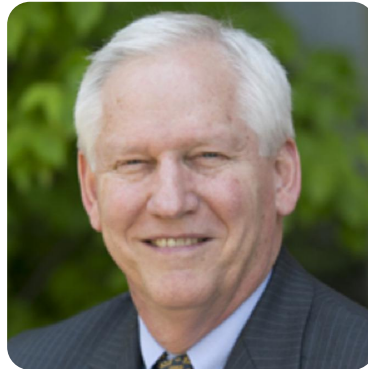
DR. MARK SEARBY CENTER FOR PASTORAL RESILIENCE