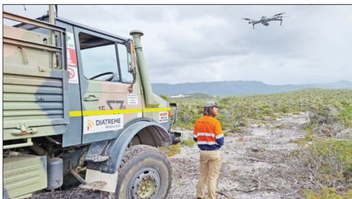
Diatreme is confident it has two major silica projects north of Cooktown.