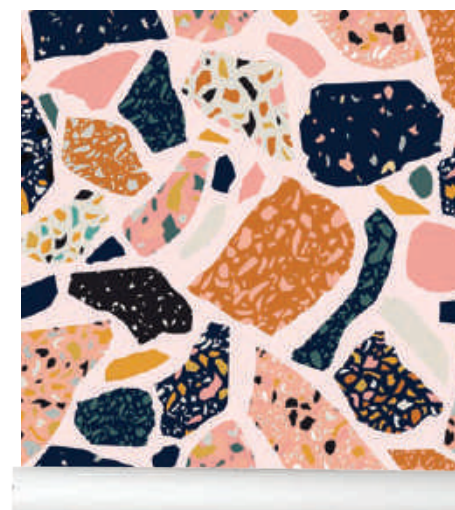
TERRAZZO ROSE PEEL AND STICK WALLPAPER from $74 per two-roll set, wallsneedlove.com