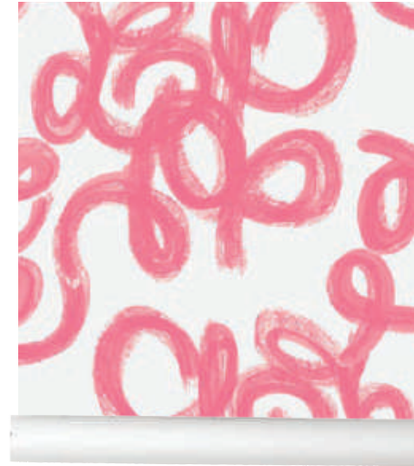
PENELOPE PEEL AND STICK WALLPAPER from $48 per roll, katiekime.com

Looking for more fun patterns? Start here.