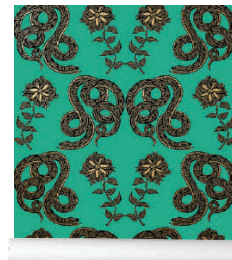
SERPENTINE WALLPAPER $225 per roll, hyggeandwest.com