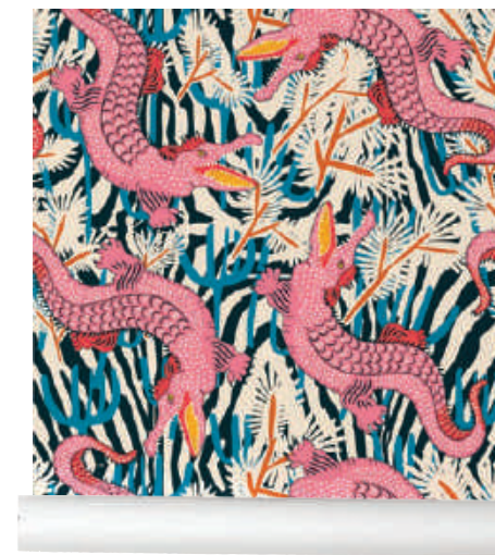
BAZAAR COSMIC GATOR PEEL AND STICK WALLPAPER from $39 per roll, spoonflower.com