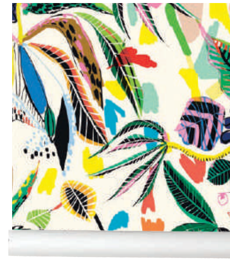
WILDERNESS WALLPAPER $285 per two-roll set, miltonandking.com