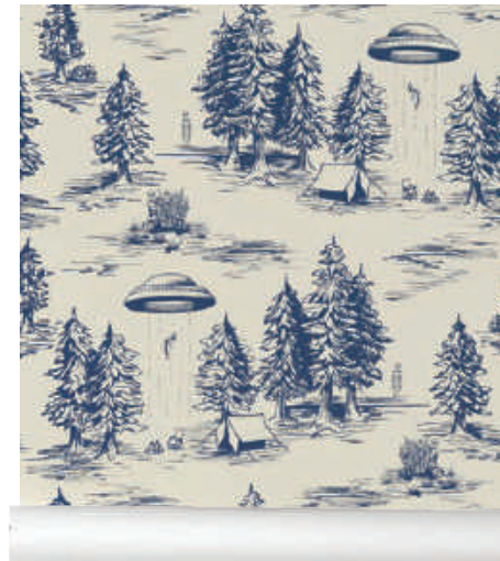
ALIEN ABDUCTION TOILE DE JOUY PEEL AND STICK WALLPAPER from $39 per roll, spoonflower.com