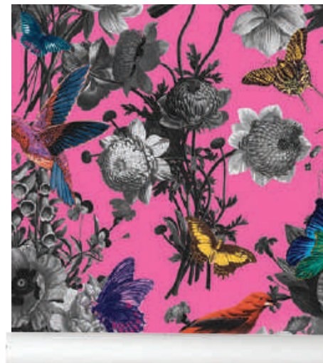
JARDIN MAGENTA WALLPAPER $160 per roll, grahambrown.com