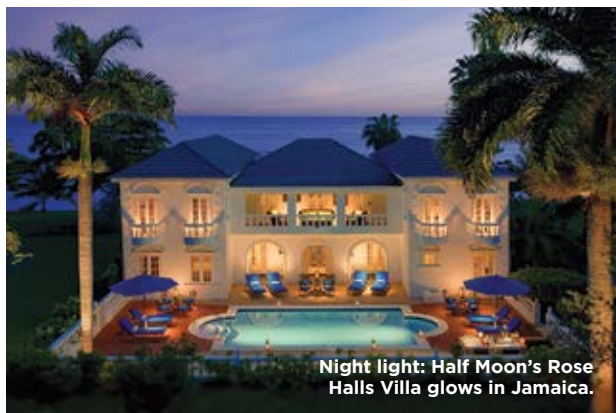
Night light: Half Moon's Rose Halls Villa glows in Jamaica.

After a morning on the beach, get dressed for afternoon tea in the Great House at the 126-room Park Hyatt St. Kitts , where you'll learn about the island's history as one of the Caribbean's biggest producers of sugarcane.