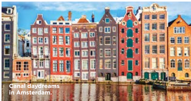
Canal daydreams in Amsterdam.

across the globe, including a six-day walking, hiking, snowshoeing, and hot-springs-soaking adventure through Iceland.