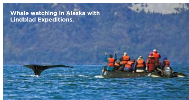
Whale watching in Alaska with Lindblad Expeditions.

A stay at the 750-room Loews Portofino Bay Hotel at Universal Orlando comes with early admission to the neighboring Islands of Adventure – home