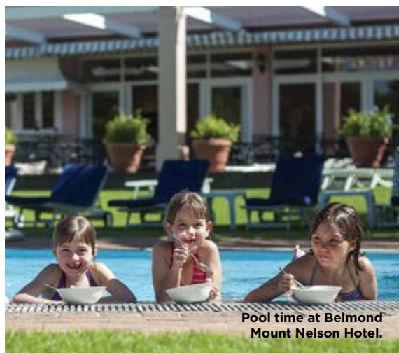
Pool time at Belmond Mount Nelson Hotel.

Tour operator Mountain Voyage Morocco customizes 7- to 14-day itineraries for families traveling to the country, from wandering through Marrakech's colorful souks to exploring the coastal town of Essaouira.