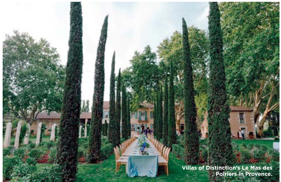
Villas of Distinction's Le Mas des Poiriers in Provence.

Travel advisors can work with Essence of Sicily , a Virtuoso on-site tour connection on the island, to customize group adventures, from a tour of the Etna volcano to a