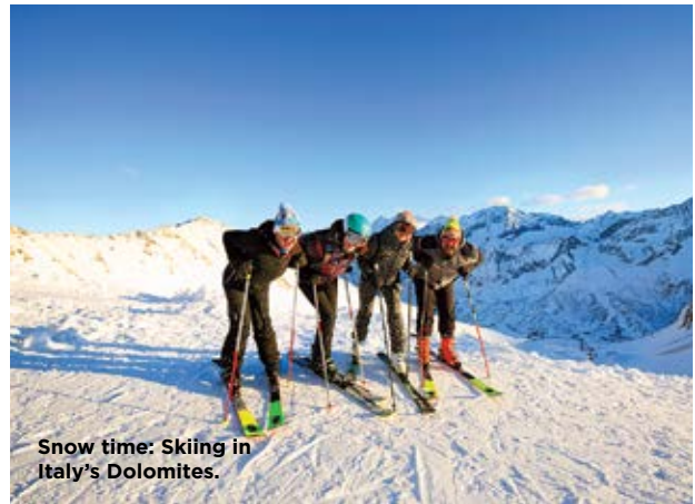
Snow time: Skiing in Italy's Dolomites.

A 45-minute drive west of Dublin, the 134-room K Club offers a myriad of activities for families, including fly-fishing, archery, and kayaking.