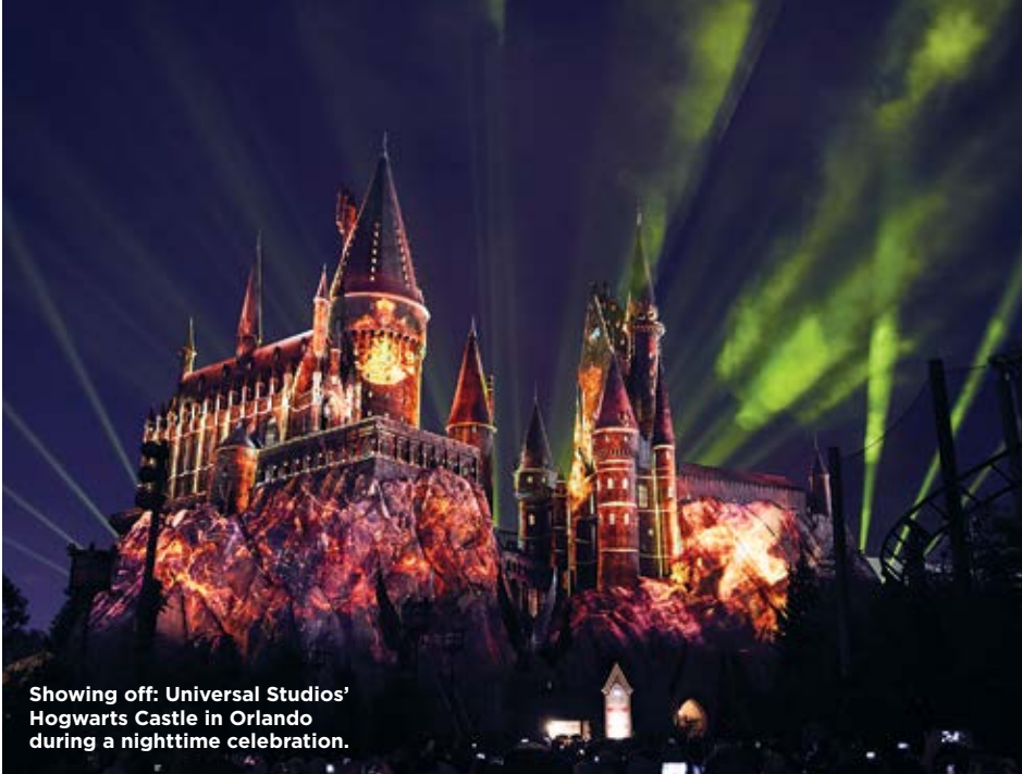
Showing off: Universal Studios' Hogwarts Castle in Orlando during a nighttime celebration.