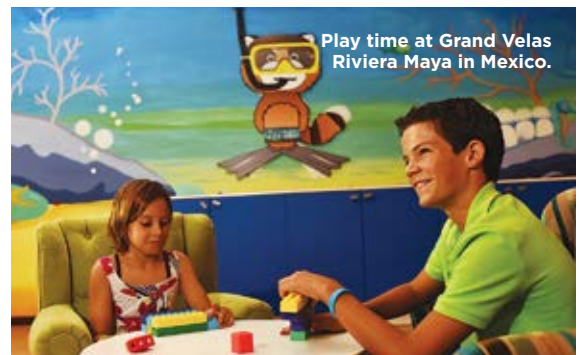
Play time at Grand Velas Riviera Maya in Mexico.

46 KEEP IT ALL-INCLUSIVE IN MEXICO. While the parents are hopping from pool to pool or relaxing at the spa at the 539-room Grand Velas Riviera Maya , children ages 4 to 12 stay busy at the kids' club, watching movies, making arts and crafts, or learning about local Mayan culture.