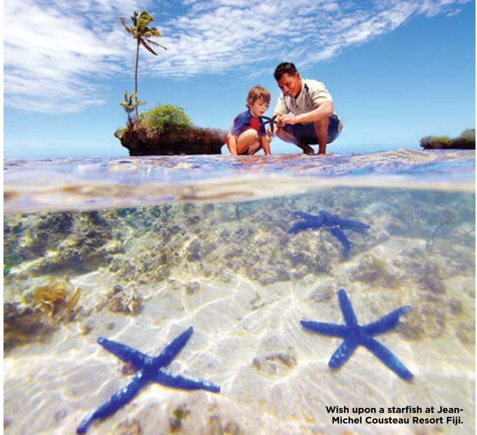
Wish upon a starfish at Jean-Michel Cousteau Resort Fiji.

Tour operator Travel2/ Islands in the Sun creates custom, family-oriented adventures in the South Pacific; head to Tahiti, Fiji, or the Cook Islands to parasail, snorkel with sharks, and lounge around on the beach.