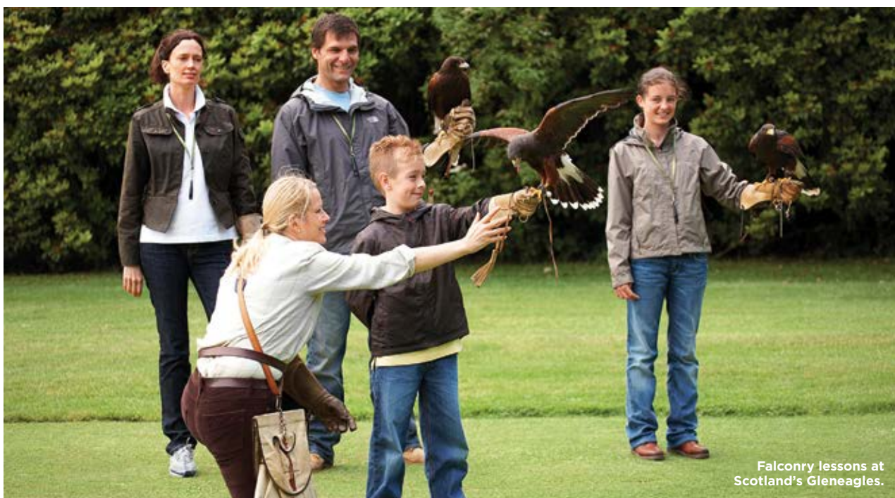
Falconry lessons at Scotland's Gleneagles.

Every January, February, and March, guests of Switzerland's 164-room Kulm Hotel St. Moritz can head out on a guided after-dark ski excursion. Novices and little ones can take ski lessons in partnership with a local school.