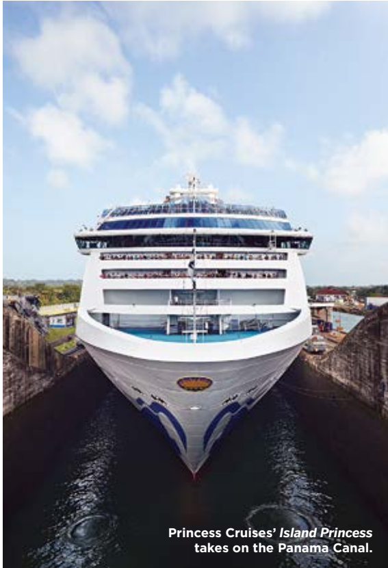
Princess Cruises' Island Princess takes on the Panama Canal.