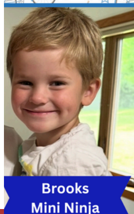
Brooks Mini Ninja