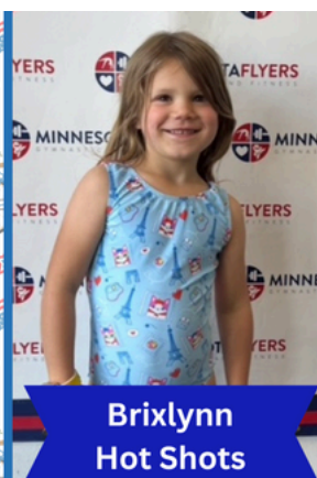
Brixlynn Hot Shots