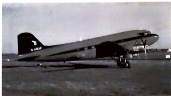
Douglas DC-3 (c/n 33436) G-ANAF at Coventry in October has recently lost her radome.

Coventry Airport, with three DC-3s (G-AMPY, G-AMRA & G-ANAF) all taking part in a formation flypast on Armistice Day overhead Bedworth in Warwickshire. Of the other members of the fleet, Dragon Rapide G-AKRP is now undergoing a major overhaul prior to joining the flight, while another Rapide, G-AIDL, flew again on Sunday September 7 after a respray in RAF training colours. She last flew in July 2007, and restores the Rapide fleet to two airworthy aircraft, with G-AGTM being the other member of the Rapide family. The last event of 2008 should be staged on the late afternoon and evening of December 14 when several members of the flight will run their engines, including a DC-3 and DC-6, and hopefully the Avro Shackleton. For the 2009 season, it is intended that the Dragon Rapides and Dove will perform much of the pleasure flying, and it would be nice to hear that the Twin Pioneer had been restored to health following her recent wing problems.