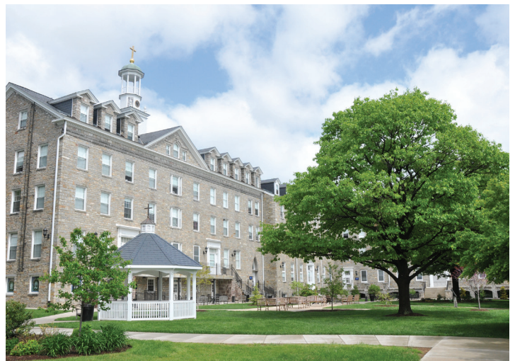
Mount St. Mary's analysis of wastewater from individual residence halls allows the University to pinpoint buildings where COVID-19 may be present and then conduct swab testing to uncover asymptomatic positive cases.

CosmosID, Inc. conducts wastewater testing twice weekly on behalf of the University and the county. The Mount's surveillance testing program includes approximately 250 COVID-19 tests a week of randomly selected student-athletes, commuter and residential students. All students and the majority of staff were tested at the start of the semester. The Mount has 1,900 full-time undergraduate students this fall, with 257 distance learners and 1,643 attending hybrid classes on campus, 1,297 of whom are residential students.