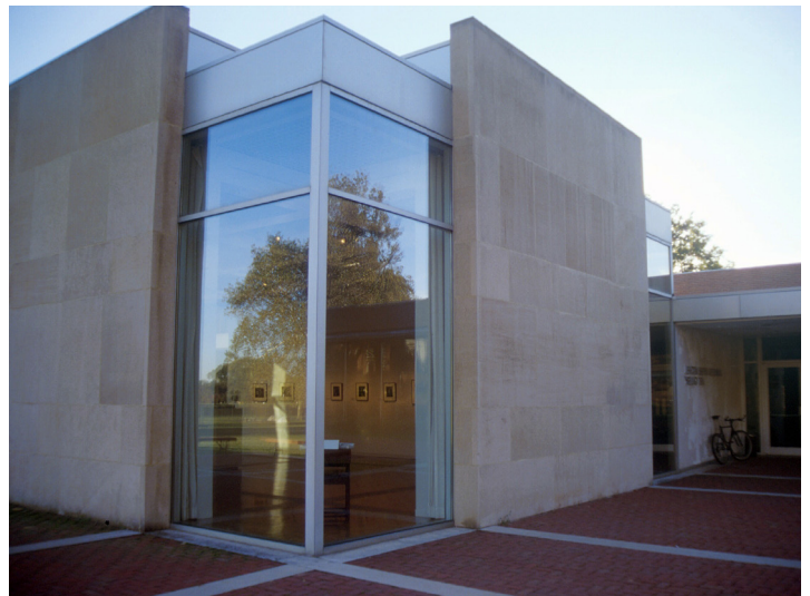
Mitchell Gallery exterior, St. John's College