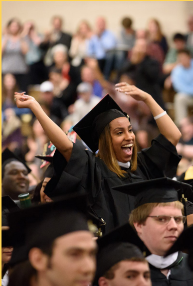
Maryland Independent College and University Association

MICUA Matters is published by the Maryland Independent College and University Association.