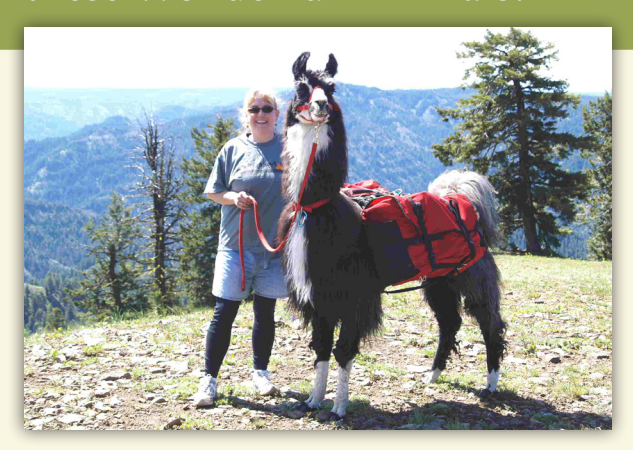
GALA LLAMA AMBASSADOR