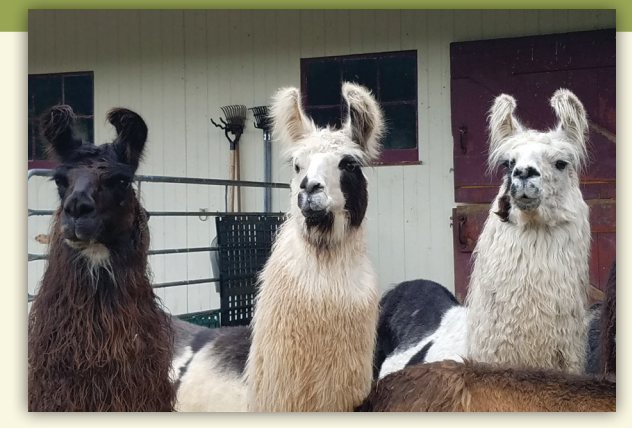
GALA LLAMA AMBASSADOR