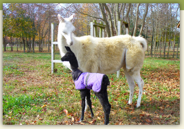
GALA LLAMA AMBASSADOR