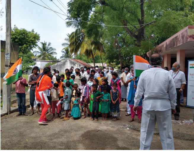
Independence Day Celebrations at Sai Aashraya Adarsh Gram, Dharmapuri, Tamilnadu.