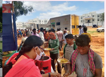
Food Seva for Construction Workers