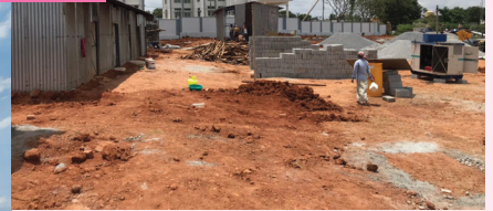
Workers & Storage Sheds @ Hospital site