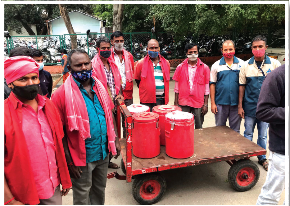
Seva for Cantonment Railway Station Porters & Housekeeping Staff

We told them that from so many decades they have been carrying the burdens of so many people, facing so many challenges. From petty bargaining to being spoken to in a rude manner the list of challenges is endless. We said that we want to take this opportunity to offer our heartfelt gratitude to them, by at least