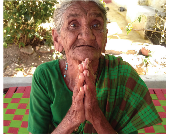
Medicare Camp - Sai Aashraya Adarsh Gram, Dharmapuri, Tamilnadu

serving them freshly cooked food personally which will give us the feeling of taking the burden off their shoulders for that half an hour or forty-five minutes. They were moved to tears. In the days that followed, we managed to get all these people to warm up to us, and openly share their thoughts and experiences with us. During our interactions with them we saw a need to serve dinner as well. Just as we were about to start serving dinner, one of the Porters walked up to us and said “Amma, from some days now we have been wanting to ask for help with dinner and were hesitating to ask thinking of the difficulties that Sai Aashraya’s Volunteers would face, travelling all the way two times a day” . We assured him that it was with great joy that we were carrying out Seva and had already thought about starting to serve dinner too. Listening to this the Porters were so happy and it reflected so clearly in their