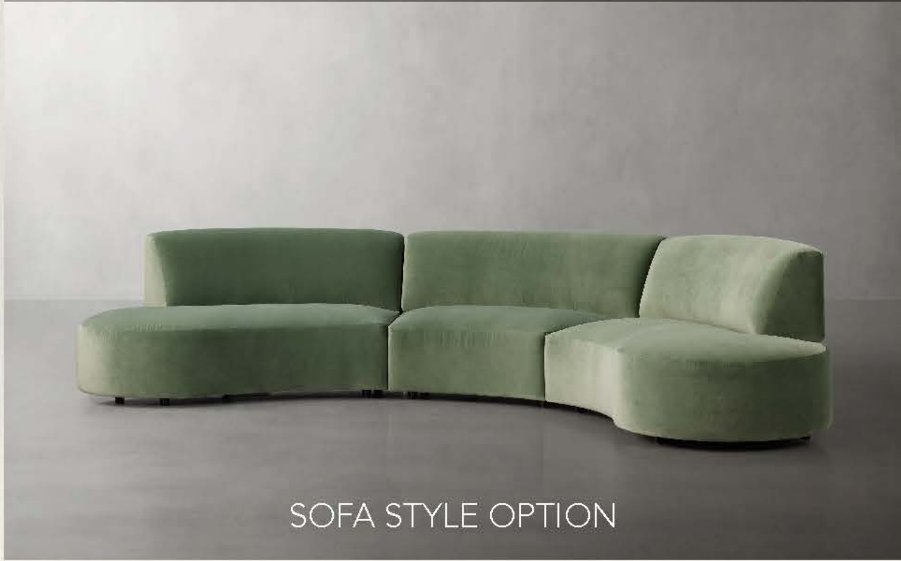
SOFA STYLE OPTION