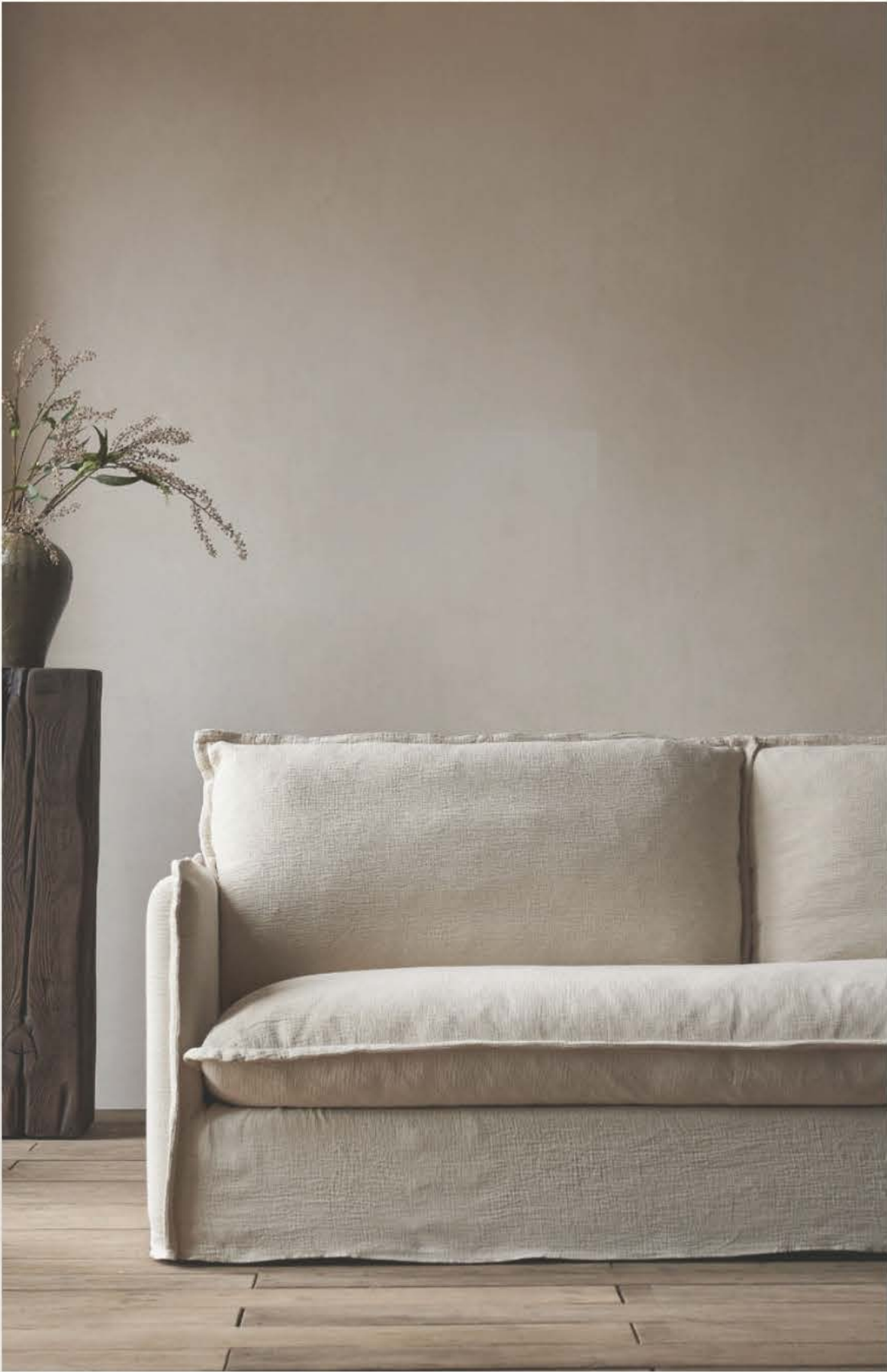
Maximize Comfort and Functionality: Design each space to enhance livability and ease of use, ensuring both style and comfort for daily life and special gatherings.