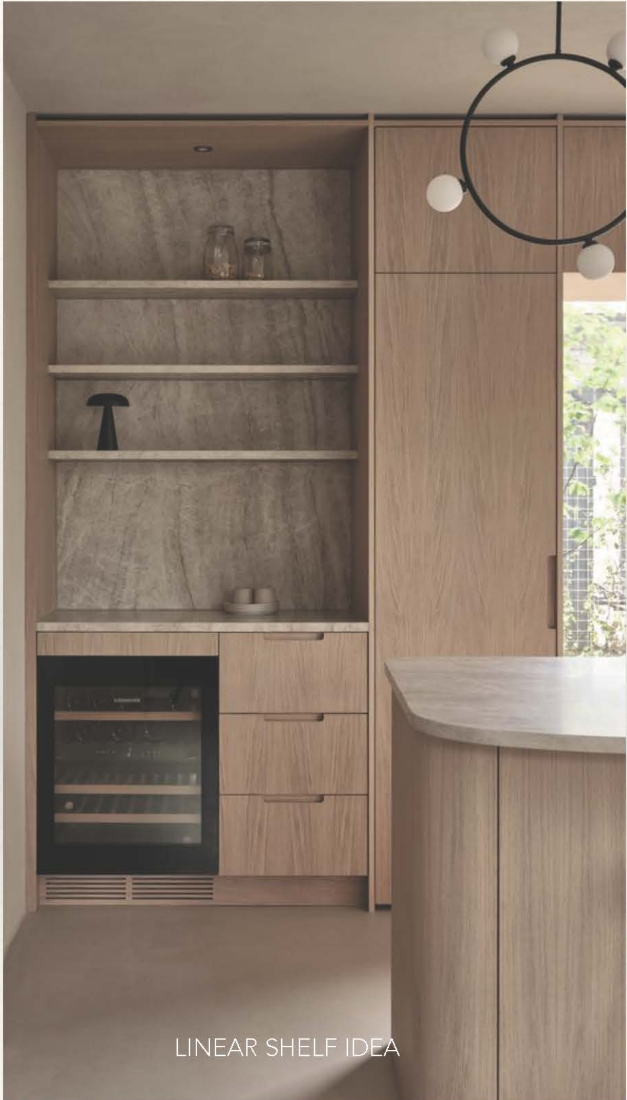
LINEAR SHELF IDEA