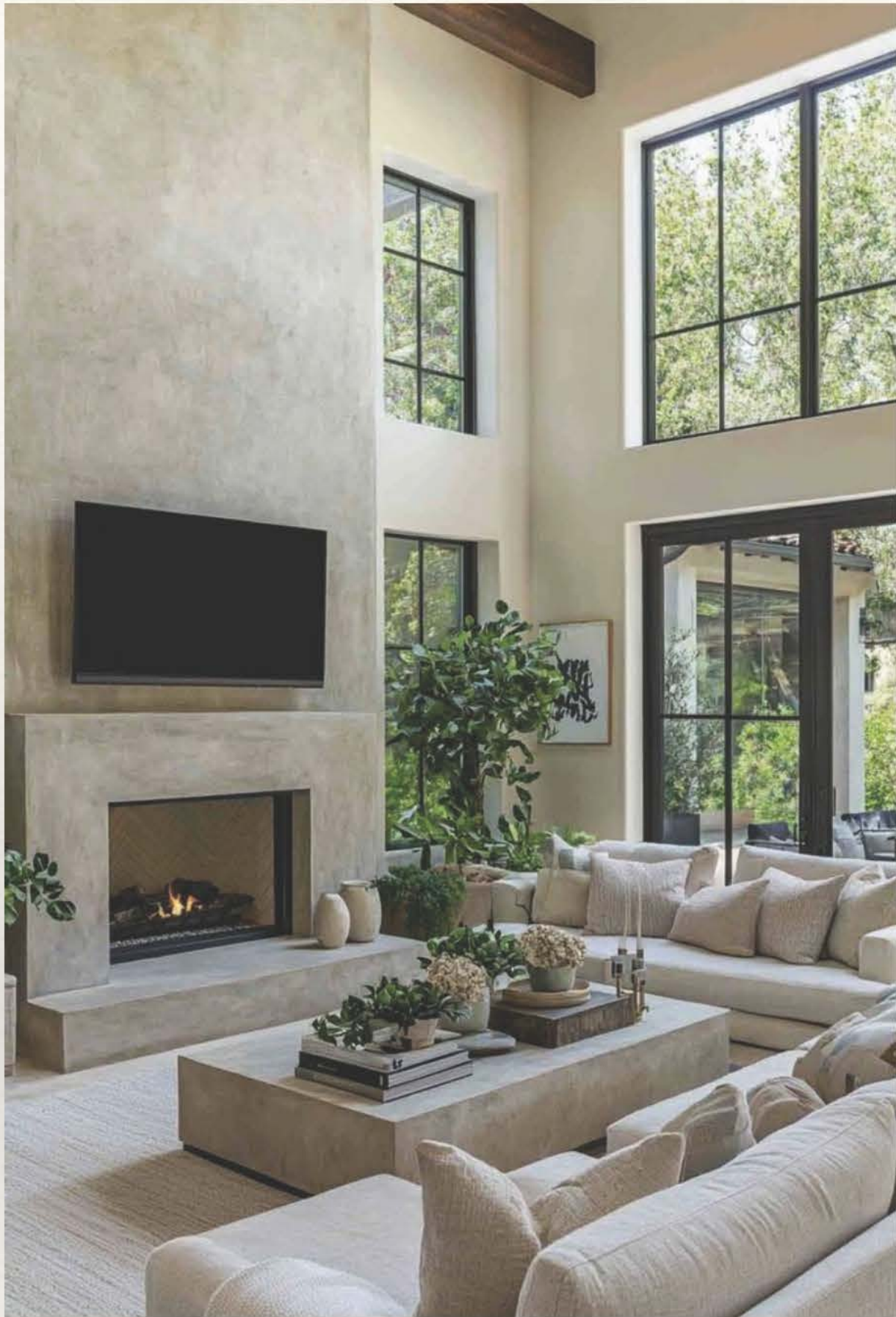
Create a Cohesive Aesthetic: Achieve a harmonious blend of light and airy and dark, moody elements to provide a balanced and inviting ambiance.