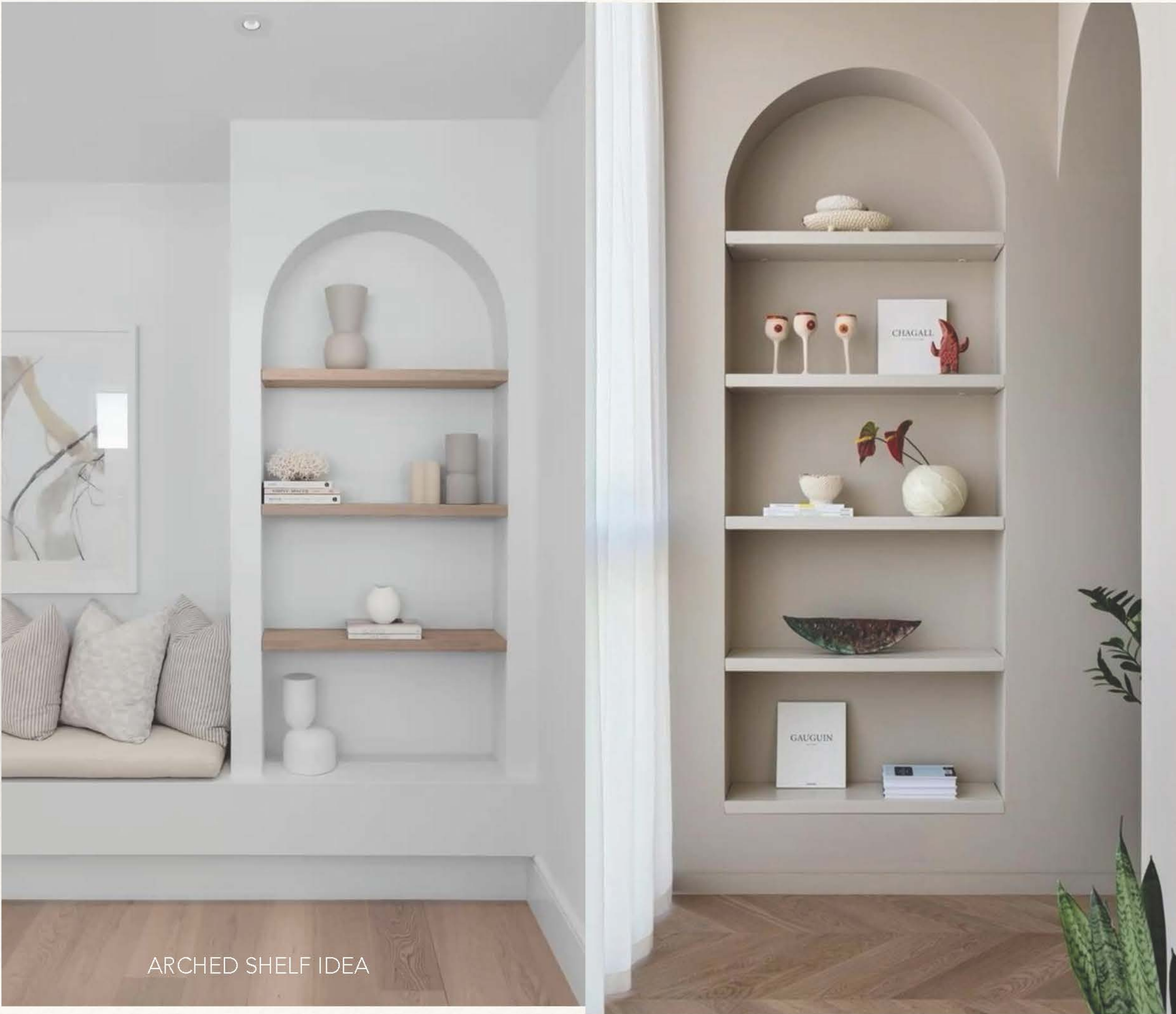
ARCHED SHELF IDEA