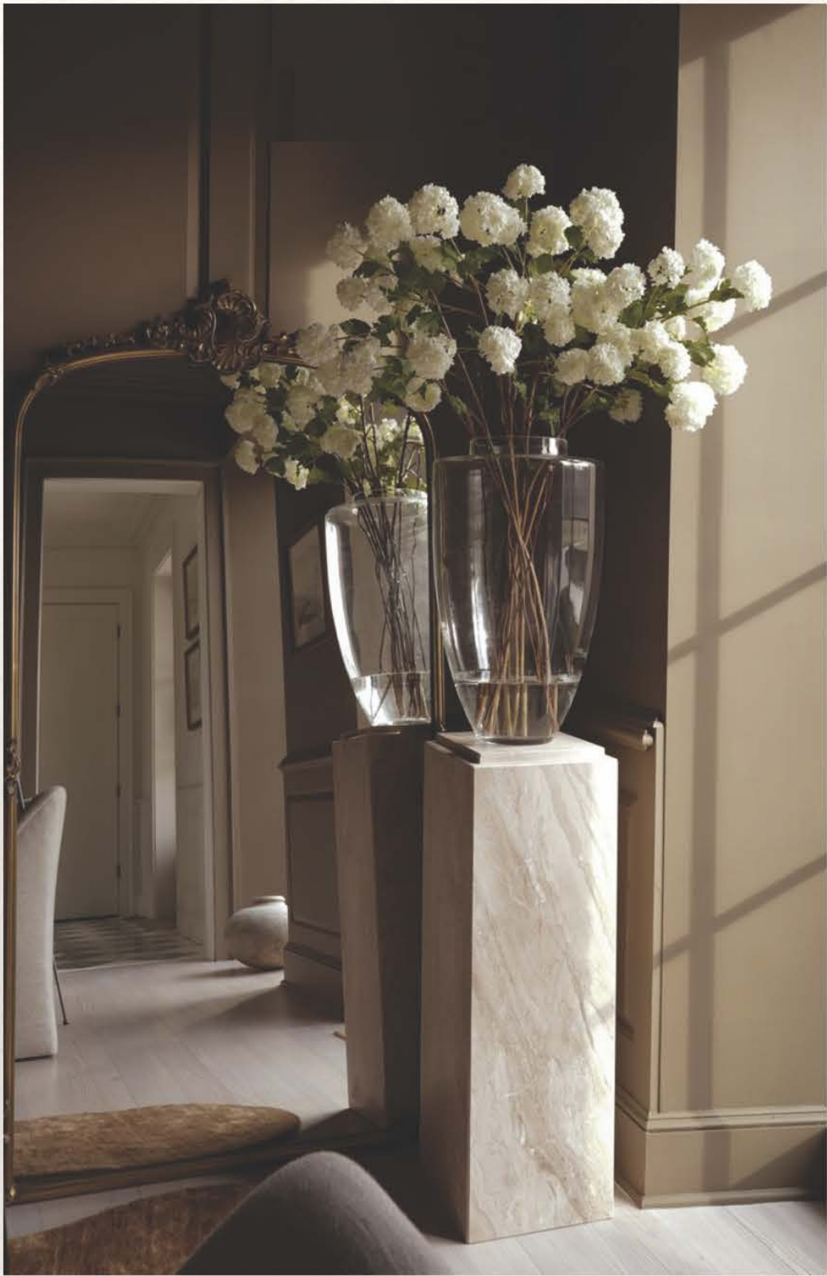
Luxurious Materials and Custom Elements: Elevate each room with high-quality materials, layered textures, and bespoke furnishings that reflect a refined, timeless luxury.