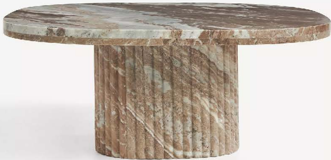
COFFEE TABLE OPTION