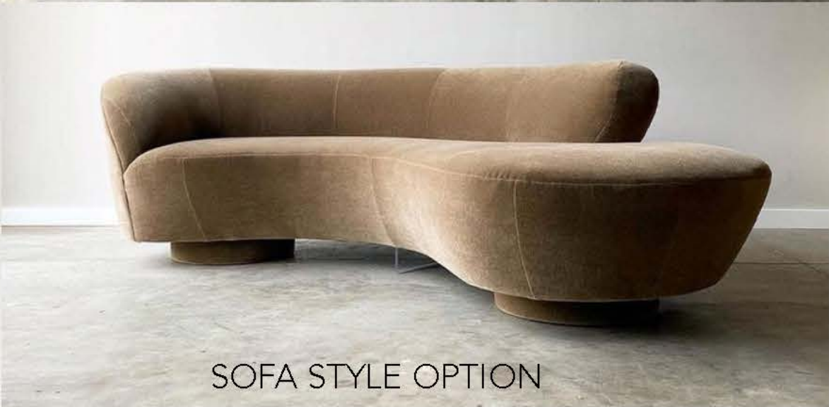
SOFA STYLE OPTION