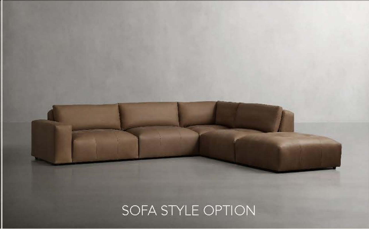
SOFA STYLE OPTION