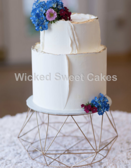
Wicked Sweet Cakes