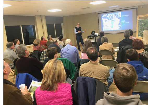
Water Quality and Your Watershed presentation.

Our outreach strategies included working with landowners in the towns of Oconomowoc, Ashippun,