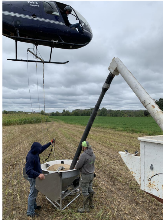
Fall aerial seeding.

TPC continues to be a major partner in the Oconomowoc Watershed Protection Program (OWPP). This program assists landowners within