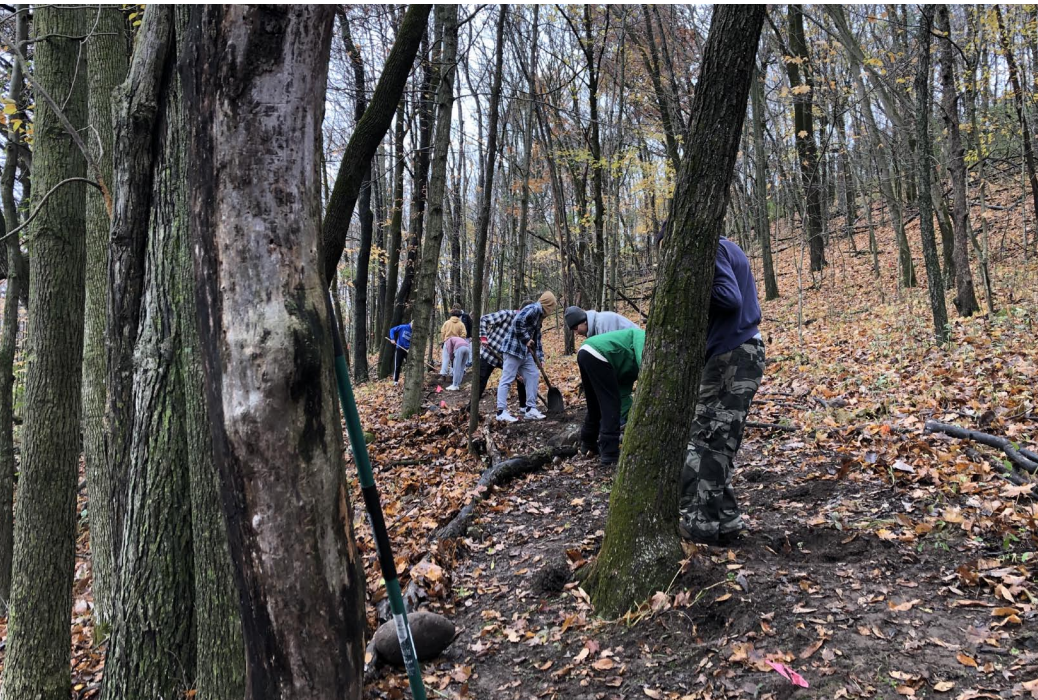
Trail building at Oconomowoc River Conservancy Park by Laudato Si' Project volunteers.

Every five years, TPC applies for renewal of our Land Trust Alliance accreditation. The lengthy and highly-detailed process, which involved our entire staff, as well as a team of volunteers from our board and sub-committees, examines every aspect of our organization – from our financial fitness to how we steward the land. In August 2020, the Land Trust Accreditation Commission awarded us renewed accreditation. Tall Pines Conservancy is one of 16 land trusts in the state of Wisconsin, and 443 in the United States, to achieve this distinction. Renewing our accreditation shows Tall Pines