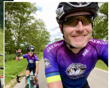
DIY Ride to the Barns.