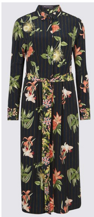
Marc's and Spencer