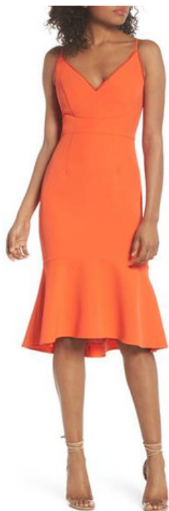
Clover and Sloane