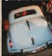
The duo made a stylish gateway after the bash.