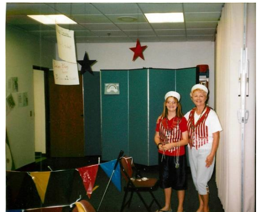
Sunday School Kickoff 2005

Sometimes we have to try and help in ways that aren’t as easy, but can end being a lot of fun. Some of our people were willing to go door to door in the early days. (pic) Others helped out in other ways.