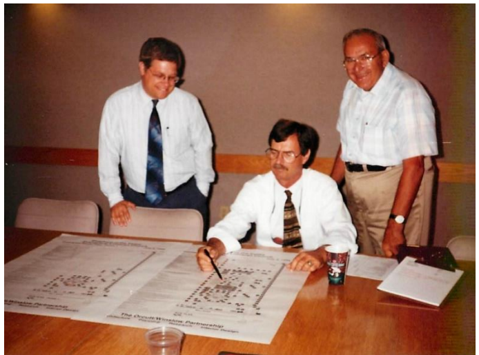
Meeting at architects office in 1998

trying to think of all the scenarios of worship and fellowship. Our answers helped us and the architect focus on the amount of space and the type of