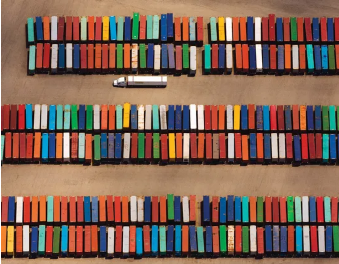
Xylophones, 48" x 72"