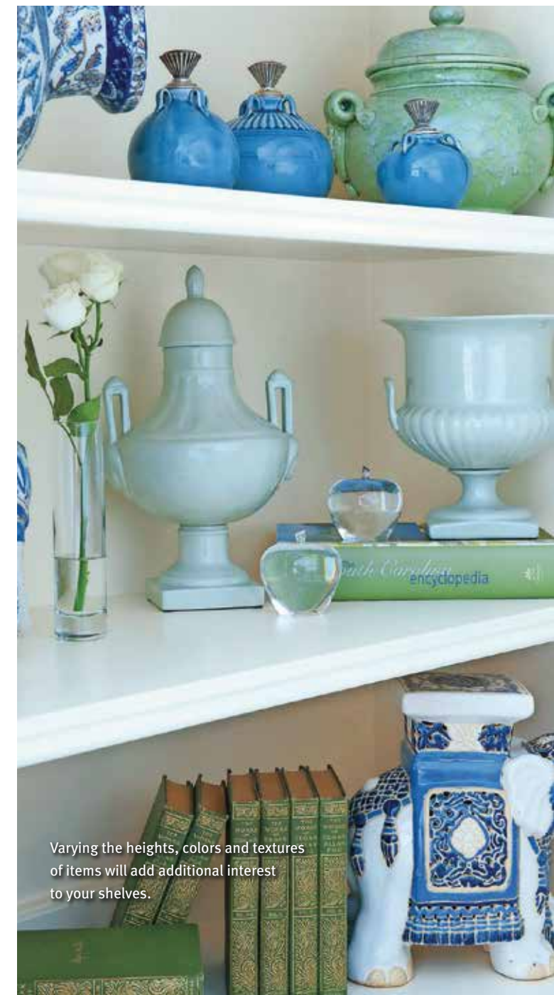
Varying the heights, colors and textures of items will add additional interest to your shelves.

While decorating shelves can be a bit overwhelming, by following these few simple rules, you will have shelves that you love!