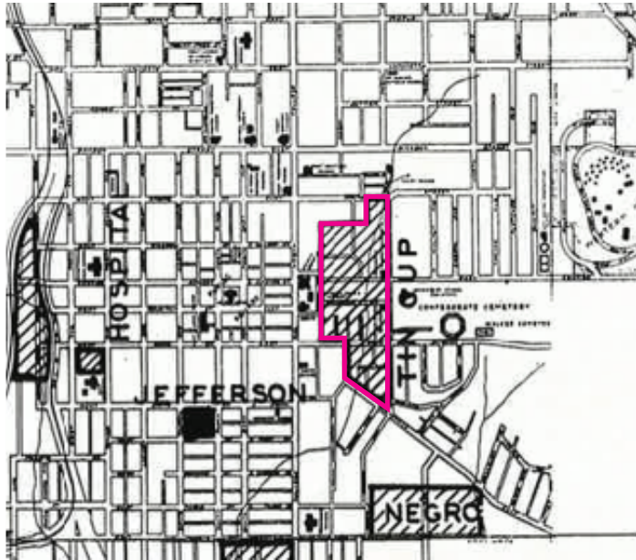
1945 Proposed replacement of Tin Cup neighborhood with a park.