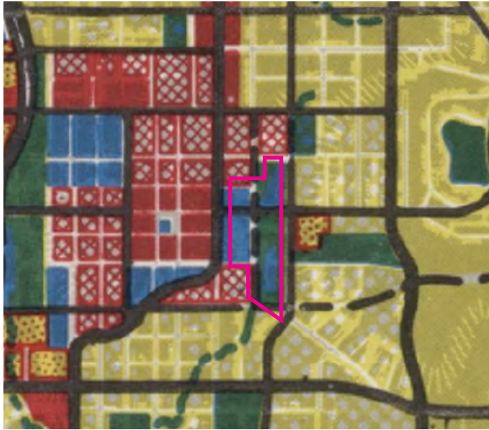
1970 - 1990 General Plan, Proposed Land Use. Blue and green areas are Public and Open Spaces.