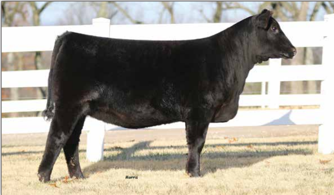
Clearwater Primrose 0036, Lot 18

Since 1933, Clearwater Farm has worked to provide quality Angus genetics that offer both performance and phenotype. The operation selectively seeks out only the best AI sires in the breed for optimum customer profitability. Visit them on the web at clearwaterangus.com.