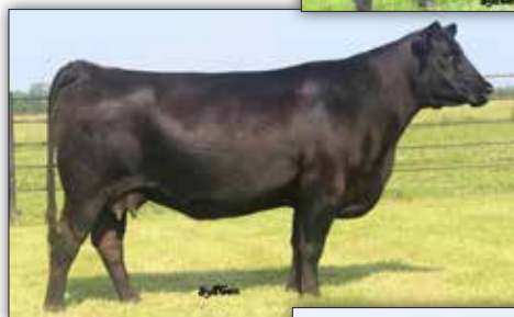
SydGen Primrose 6220, Granddam of Lot 39