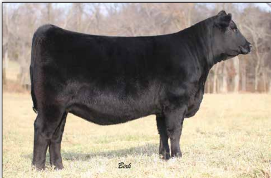
BAR Rita 7706-N68, Maternal Sister to Lot 8