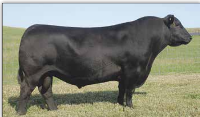
SAV Sensation 5615, Sire of Lot 30