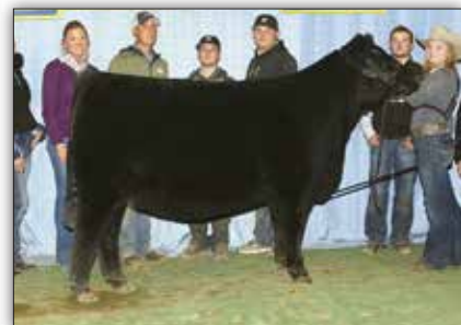
The Many Time Champion, "6883"

LK Forever Lady 033 is a direct daughter of EXAR Forever Lady 6883, a $16,000 purchase in the 2017 Express Ranches Honor Roll Sale. "6883" holds the title of the 2018 ROV Senior Heifer Calf High Point Heifer of the Year and had several victories in her 2018 career including Atlantic National Senior Heifer Calf Champion, National Junior Angus Show Heifer Champion and the National Western Senior Heifer Calf Champion. This is a unique opportunity to own a heifer calf out of one of the most nationally talked-about show heifers in recent times who has now joined the ranks of the breed's elite donor cows and will forever be a member of one of the most potent cow families to stand at Meyer Cattle Co. and Express Ranches.