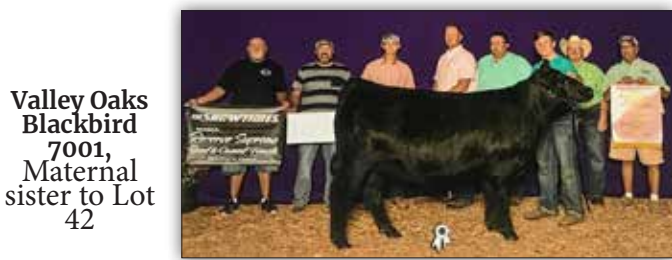
Valley Oaks Blackbird 7001, Maternal sister to Lot 42