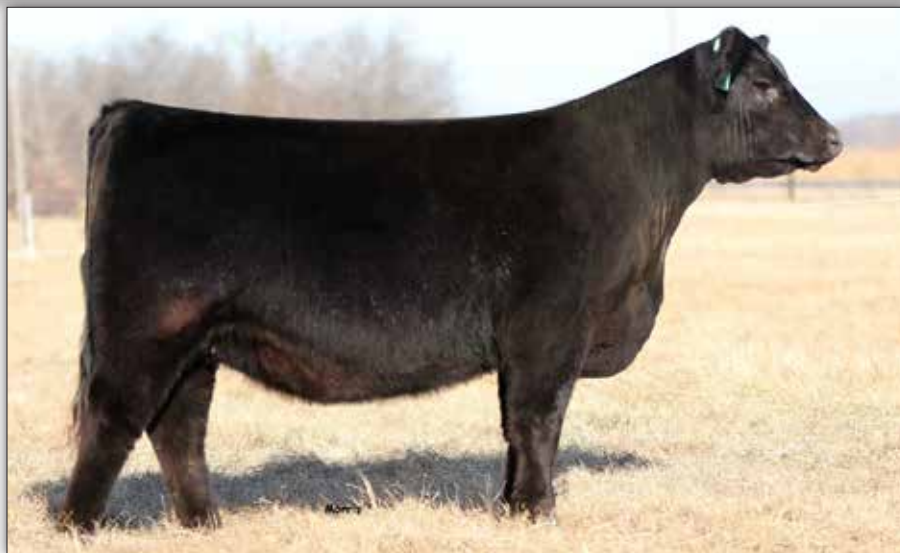
LK Erica 9113, Lot 35