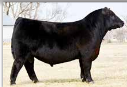
KR Cadillac Ranch , Sire of Lot 44