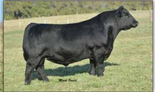
PVF Insight 0129, Sire of Lot 31