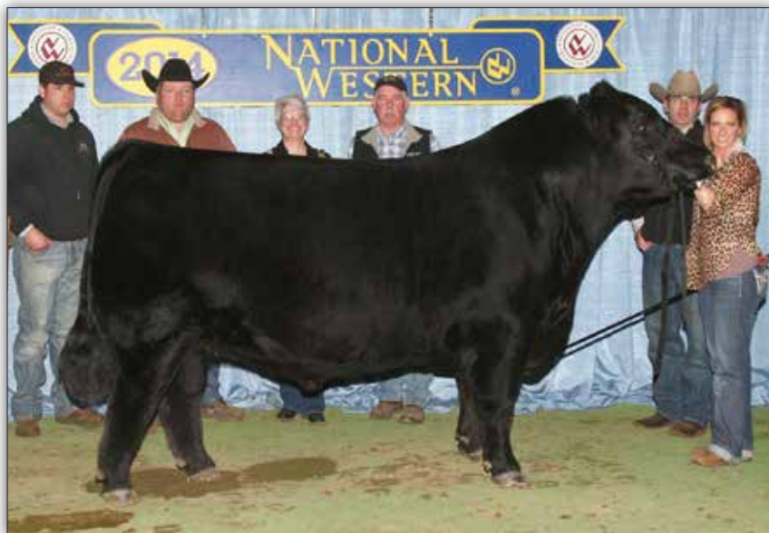
74-51 Sudden Look 1023, Sire of Lot 29

Hunter Angus is a fifth generation Angus farm in Fair Grove, MO. They focus on breeding cattle that will compete in the showing and excel in the donor pen. With their donor lineup growing, they are excited to be raising more embryo calves each year. Thank you for your consideration of their lots. Join them for their annual production sale on April 1st.