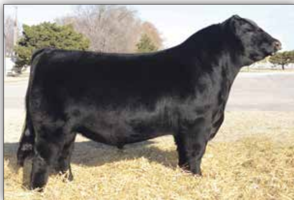
S&R Roundtable J328, Sire of Lot 25