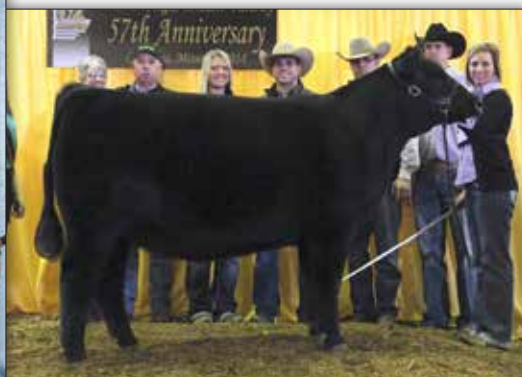
Hunters Mercedes Jewel 235, Granddam of Lot 29

Here is a stylish direct daughter of "Sudden Look." Her granddam, Hunters Mercedes Jewel 235, was the 2014 Missouri Angus Breeders' Futurity Show Reserve Grand Champion Female. Her granddam is also a maternal sister to the dam of Hunters Old Town Road 720. This is a pedigree that has been a no miss for Hunter Angus with lots of future in this heifer.