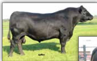
Bakers Northside 6007, Sire of Lot 39 & 43