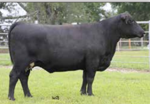
VOA Miss Ten X 4009, Donor of Lot 43