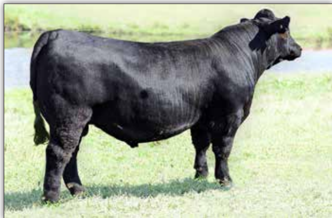
Byergo Ten-Four, Lot 10