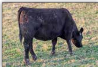
Byergo Clover G85, Donor of Lot 12