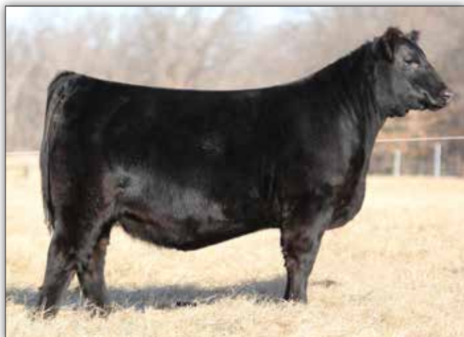
TCCC Forever Lady 91940, Lot 40

Triple C Cattle Company is a practical working farm operation in Pike County, MO. They pride themselves on producing balanced cattle who have showring eye appeal yet have real world commercial merit.