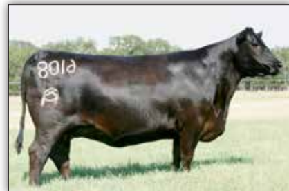
DRMCTR 111 Rita 6108, Maternal Great Granddam to Lot 8