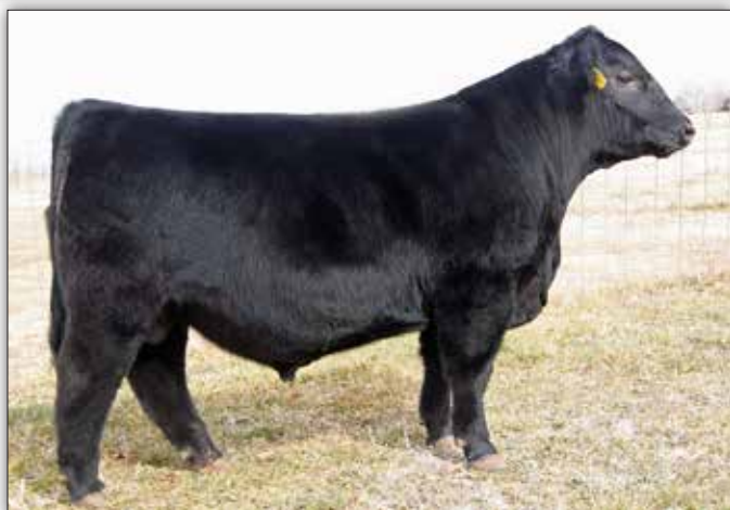
Checkerhill Blue Chip 025, Lot 15