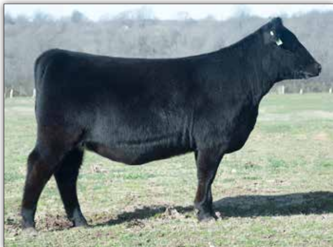
Gleonda Elia H086, Lot 24