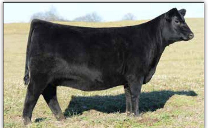
Birks Forever Lady 79 , Lot 7

• Donor cow at its very best with this super complete and attractive female. Sired by TEX Playbook 5437 who is one of the best female producers of all time. Maternal sister is Birks Forever Lady 14, the $15,000 ½ interest female sold to York Farms of Palestine, IL. Maternal sister was an eight-time undefeated cow/calf pair champion in 2016. 79 sells due to calve 2/18/2021 to the popular GAR Hometown and sexed as a heifer calf. • Birk Beef Cattle is retaining an embryo interest only.