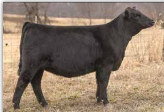
WAF Hazel H015, Lot 46