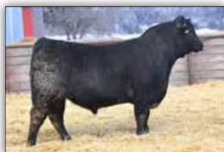
De-Su Volunteer B122, Sire of Lot 11