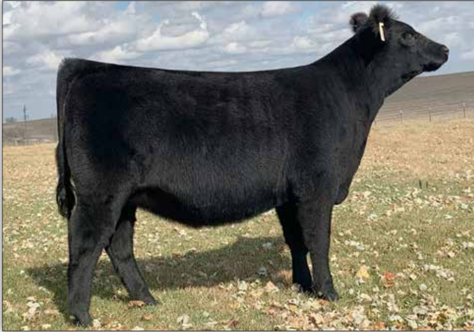
J4 Susan 004, Lot 22

Fair Oaks is a family owned and operated purebred Angus farm located in Savannah, Missouri. Backed by four generations of agriculture enthusiasts, we are focused on developing high quality Angus cattle with balanced traits. Like Fair Oaks Farm on Facebook for more information.