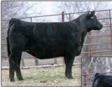
Behlmann Winsome 1503, Lot 1

Behlmann Angus is a family run organization producing and promoting registered Angus genetics. They are committed to producing the right kind of genetics to enhance the productivity, sustainability, and profitability of their customers. Behlmann Angus has worked hard to raise Angus cattle that are structurally sound with the performance and eye appeal to work in either the feedlot or show ring. Their inspiration comes from their customers success and your satisfaction remains their highest priority.