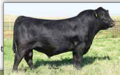
Byergo Black Magic, Sire of Lot 13 & 14