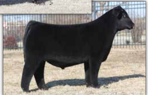
Conley Lead The Way 0738, Lot 4A and 4B Semen