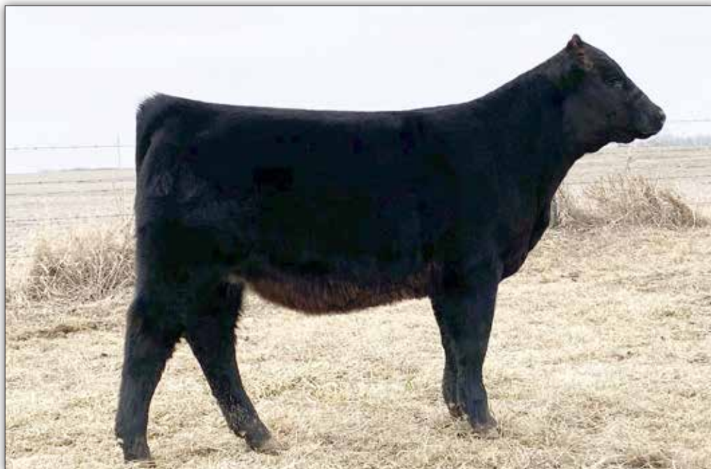
Durham Lass G7, Lot 21

• The traditional pre-sale show would have been perfect for this heifer with PVF Insight 0129 at his best. A daughter of their proven donor dam that never misses. G7 has a sweet disposition and a look that will stop you in your tracks. She has the potential to not only bring home a purple ribbon or two, but also be a valuable breeding piece. Worth a drive to come see her! As a note, this heifer poked her eye as a baby and has a very small scar on her non-show side. It is small and does not bother her. G7's full sister is selling as well!