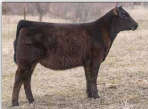
WAF Sandy H090, Lot 45

• H090 has power in the blood! Out of the bull that sold half-interest for $250,000, "Generation" offers genetic excellence across the beef production spectrum. H090's dam is a full sister to the $400,000 valued top-selling Conley Express 7211, one of the hottest bulls in the industry. This outstanding mating is a granddaughter of the past National Western Stock Show Grand Champion, SMA Watchout 482, back to the ever-popular DPL Sandy 3040, who was the 2015 Reserve Grand Champion Owned Female of the National Junior Angus Show and the Grand Champion Female of the 2014 Western National Angus Futurity Junior Show. A full sister to the maternal granddam, Silveiras SS Sandy 2355, went on to produce the $105,000 Conley Sandy 7305 that sold to J6 Farms in NE. This popular pedigree has the opportunity to become your next donor females.