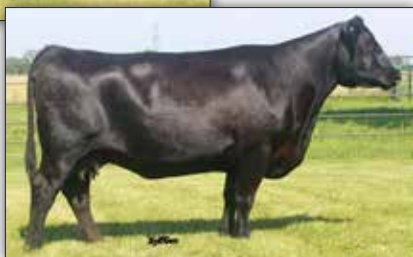
B/R TL Primrose 2186, Great Granddam of Lot 39