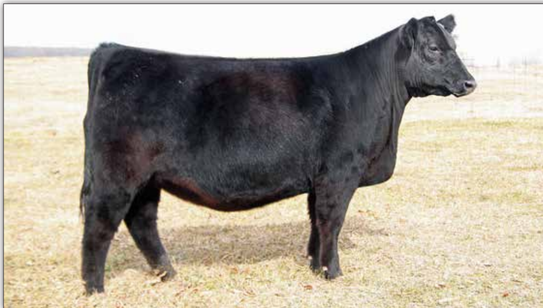
Checkerhill Danica 930, Lot 16