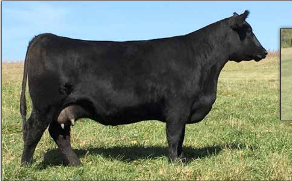
M Bar M Rita 802, Donor of Lot 31

M Bar M Cattle Company is a fall calving seed stock producer in NW Missouri. Concentrating on proven genetics, structure, environment and eye appeal allows them to produce cattle that excel in the pasture, perform on the rail and compete in the showing.