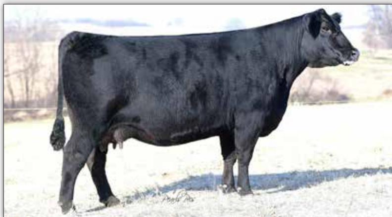
Byergo Clover 595, Donor of Lot 13