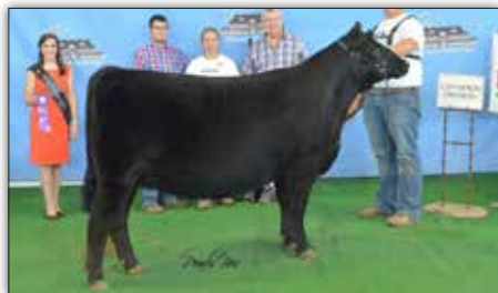
EXAR Princess 4715, Granddam of Lot 25