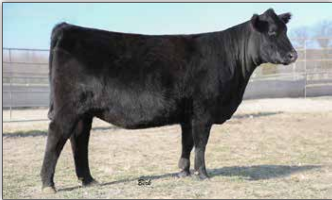
Valley Oaks Blackbird S975, Lot 42