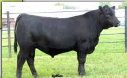
SydGen Brickyard, Maternal Brother to Donor of Lot 39