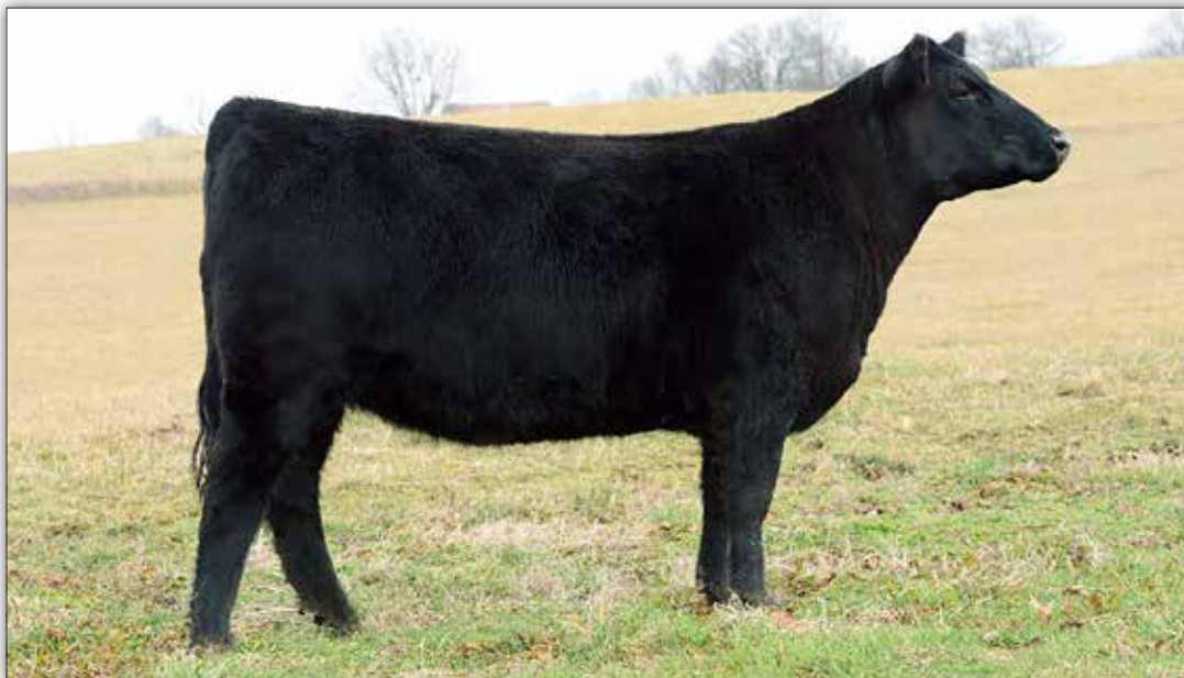
Hat Creek Forever Lady 807G, Lot 27

· This stylish female is super attractive from the profile and feminine in her design. She comes from an outstanding first calf heifer and was the highest weaning weight in her contemporary. Her maternal granddam is a donor in the Hat Creek Genetics program and boasts a weaning ratio of 3@108. Out of the Origen sire EXAR Monumental, she has donor potential with the combination of maternal pedigree with style and design. She is due 9/3/2021, bred to Deer Valley Unique.