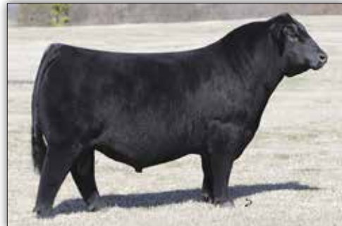
Conley Express 7211, Lot 3

• As an own daughter of the popular Stevenson Turning Point this female also blends in power genetics from the Musgrave program in IL and the Styles program in SD. Additionally, she stems from the highly renowned Primrose cow family that has left a lasting impact on the Dameron program of IL and the Express Angus Ranches program of OK. From a versatility standpoint this heifer not only offers a pedigree with mating flexibility, but also post a healthy set of production EPDs that spread from a negative BW to a triple digit YW and she is a female that ranks in the top 25% of the breed for $M.