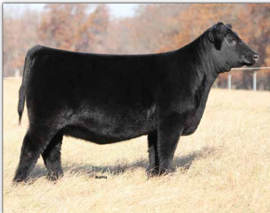
LK Forever Lady 033, Lot 34

A foundation female in the making with a progressive set of growth EPDs and the phenotypic perfection that Meyer Cattle Co. strives for. The maternal granddam of this heifer is an own daughter of the famous EXAR 263C herd sire that made a powerful impact across the Angus cow herd and a bull whose top shelf reputation was largely earned by his high quality, hardworking daughters. Truly a breeding piece that has the potential to be the start of something big in her new program.