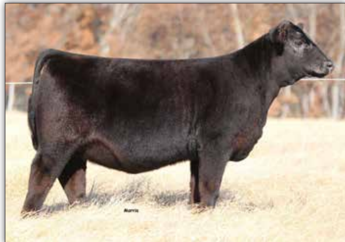
Meyer Blackcap 020, Lot 33

A foundation female in the making with a progressive set of growth EPDs and the phenotypic perfection that Meyer Cattle Co. strives for. The maternal granddam of this heifer is an own daughter of the famous EXAR 263C herd sire that made a powerful impact across the Angus cow herd and a bull whose top shelf reputation was largely earned by his high quality, hardworking daughters. Truly a breeding piece that has the potential to be the start of something big in her new program.