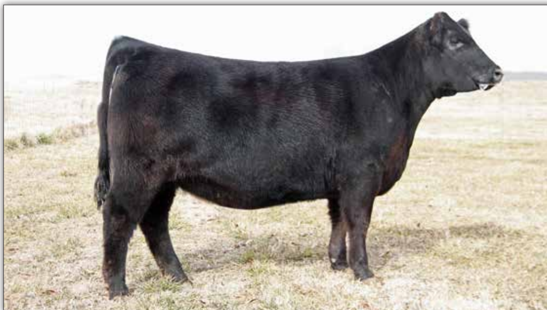
Hickory Hill Missy 952, Lot 17