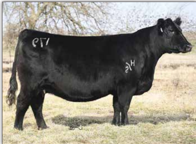
H S Emblazon Erica 179, Donor of Lot 28 Choice

Tracing back four generations with nearly a century of Angus heritage in their background, the main focus of Hillside Angus is to produce cutting edge genetics, providing their customers with the highest quality. Hillside Angus takes great pride in their strong reputation in producing sound, functional and phenotypically correct cattle than not only perform in the showing but the pasture as well.