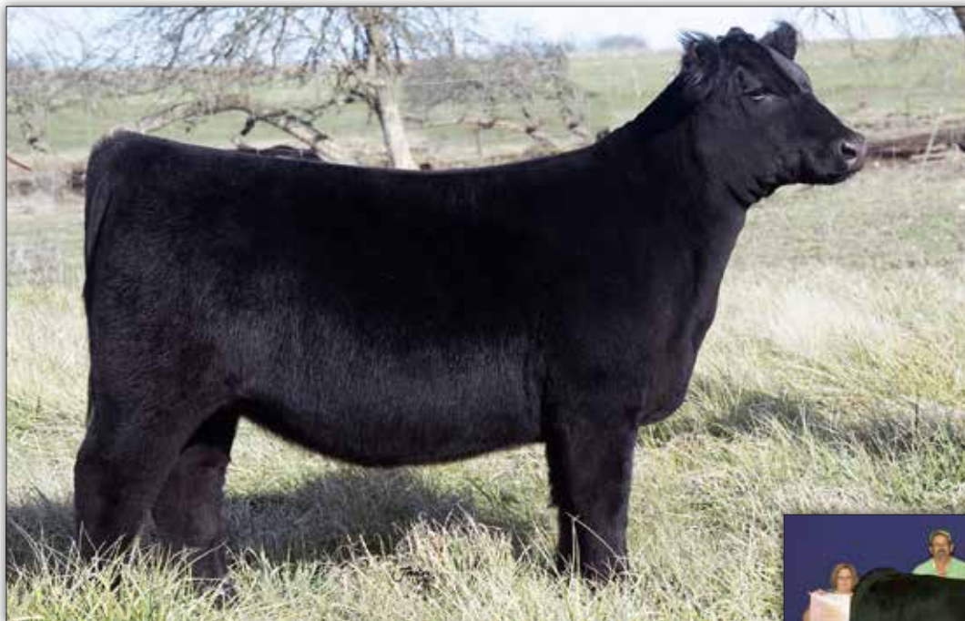
High Point Miss Corona 607, Lot 37

As of September 2020, Moyer Cattle Company added a fourth generation to their farm that was established in 1977 with the birth of Emery Grace Faubion. We raise Angus cattle with a focus on quality and practical genetics from the pasture to the table. Look for us in the future under the name, High Point Farms.