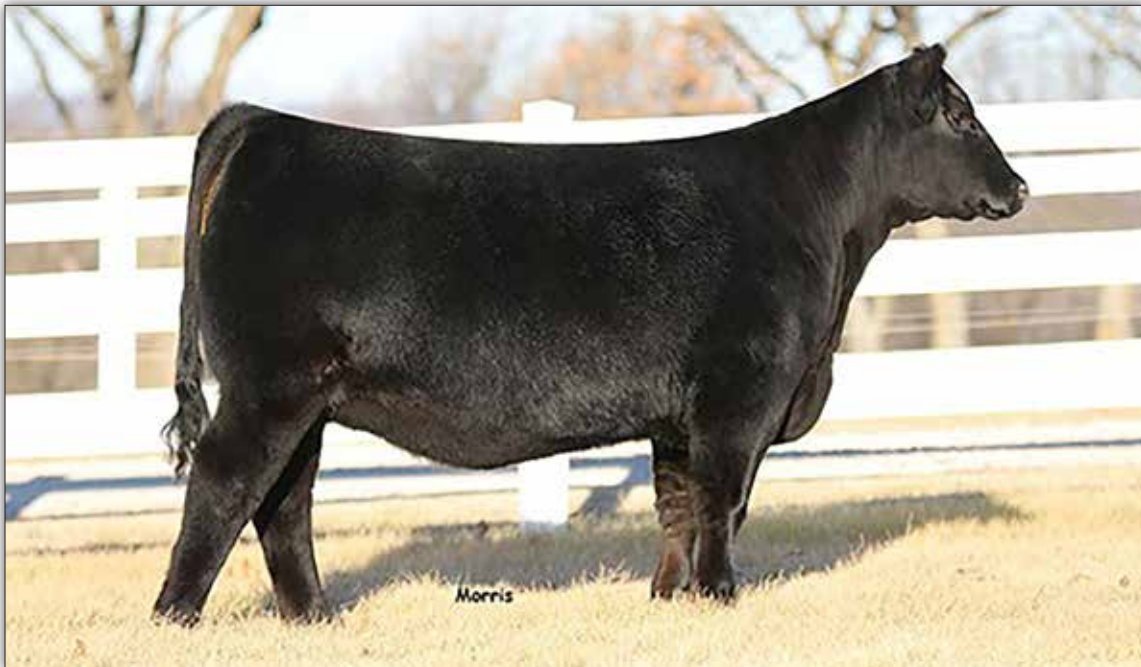
Clearwater Primrose 9318, Lot 19

This deep-bodied, square-hipped and maternally designed female is the ultimate cow prospect. Her dam by VAR Reserve 1111 is a true power cow with an excellent udder and stems from the proven Primrose cow family. Stemming from an AI sire who brings a maternal package second to none, TEX Playbook 5437. Form and function all wrapped up in this one. Don't miss out on an opportunity to secure your maternal legacy with her top 1% of the breed $M ranking! 9318 sells AI bred to Wilks Regiment 9035, due 10/8/2021.