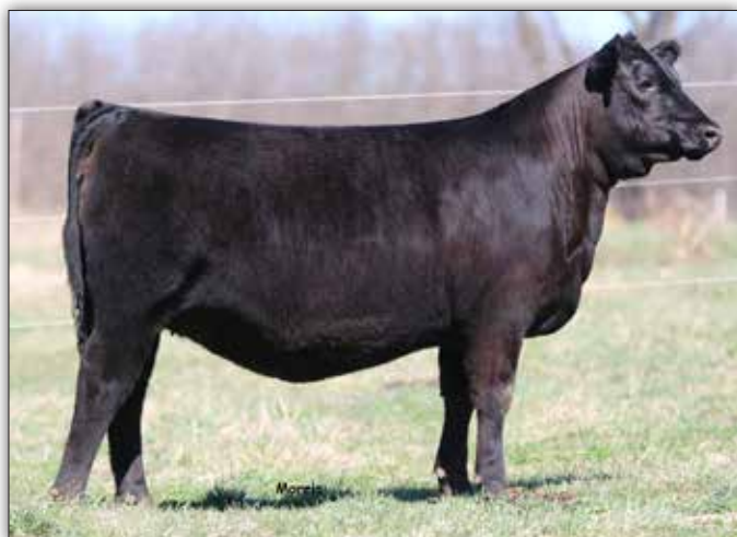
Coleman Donna 6254, Maternal sister to Lot 30

Here is a stylish direct daughter of "Sudden Look." Her granddam, Hunters Mercedes Jewel 235, was the 2014 Missouri Angus Breeders' Futurity Show Reserve Grand Champion Female. Her granddam is also a maternal sister to the dam of Hunters Old Town Road 720. This is a pedigree that has been a no miss for Hunter Angus with lots of future in this heifer.