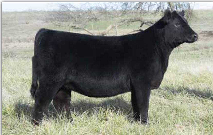
High Point Barbra 522, Lot 38

• With a pedigree like what she has, you won't want to pass on this June heifer. Picked out of the donor pen, 522 offers show ring potential and future cow power. Her maternal grandsire is the hugely popular 2013 Senior Champion Bull in Denver that was also named the Grand Champion Bull at the 2013 Missouri State Fair. 522's sire, HMM JC Insight 104, also saw success in the showing being named the Reserve Junior Champion Bull at the 2017 Missouri Junior Angus Preview Show and the Reserve Grand Champion Bull at the 2018 Ozark Empire Fair.