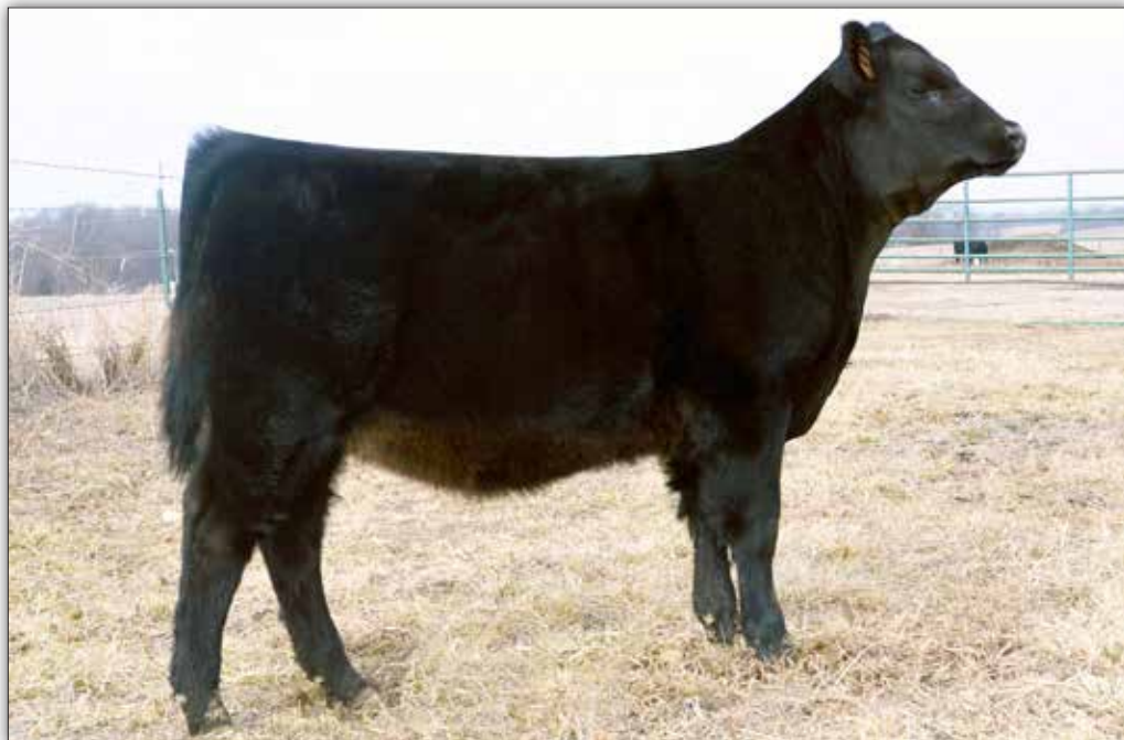
Durham Lass G8, Lot 20

Durham Angus Farms is a herd of small numbers, but high quality. They use their Angus cows as a foundation to both SimAngus and Angus genetics. They are happy, and thankful, to be a part of the Angus Futurity and love to talk to you about their cattle!