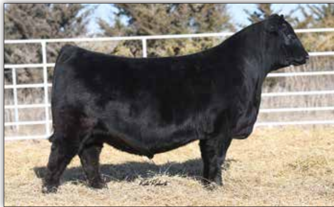
Mohnen Rip, Sire of Lot 28 Choice