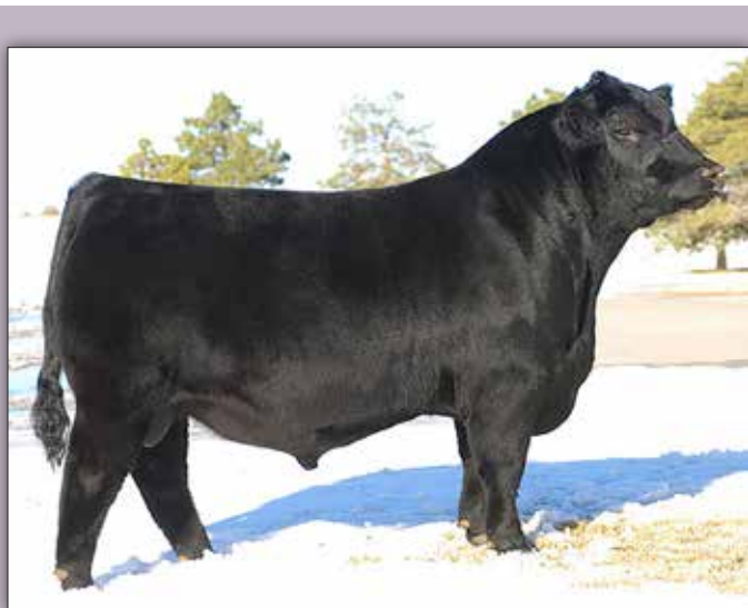
Dameron First Class, Lot 32 Semen