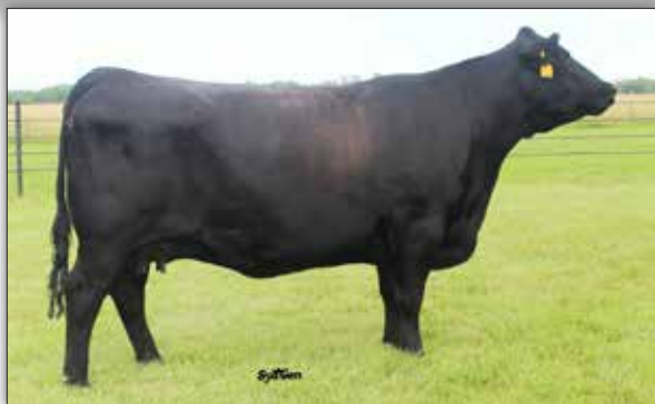
SydGen Eileenmere 2004 , Granddam of Lot 44