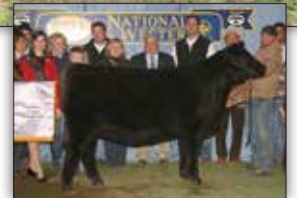
Top Line Lady 3011 , Granddam of Lot 6