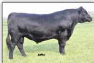
SydGen KCF Gavel 8361, Sire of Lot 12