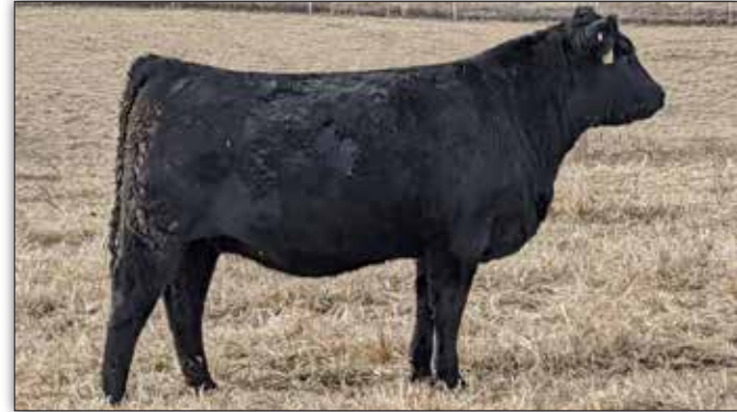
Byergo Clover G52, Donor of Lot 11

An exciting offering of a top 5% or better WW, YW, RADG, CW, $F, $B and $C backed by generations of Byergo genetics. Byergo Ten-Four is a maternal brother to the $16,000 top selling bull at the 2020 Midland Bull Test and to Byergo Clover 150, the Baldrige Performance/Byergo Beef proven donor. Ten-Four has a gentle disposition, yet he is athletic and active in the pasture. He offers a more moderate CED than most sons of Black Magic, but maintains the structure, growth, and carcass EPDs. Byergo Beef Genetics has used him naturally in their own cow herd, so we are offering full ownership and possession! He has an adjusted 365 SC of 40.