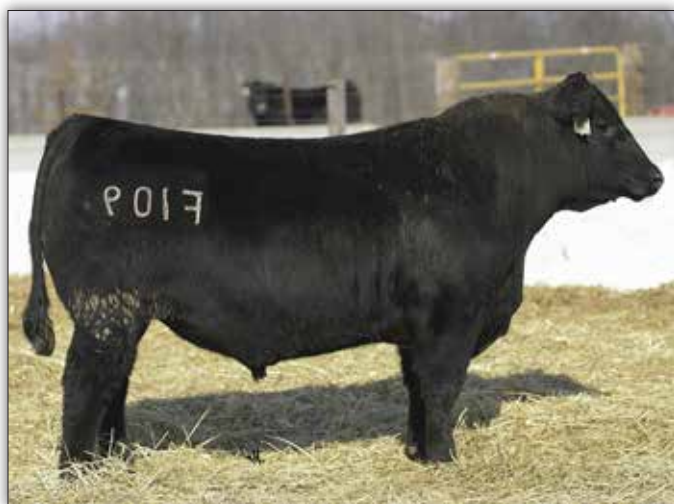
Woodhill Relevance, Lot 9 Semen

Brinkley Angus Ranch is willing to calve the cow and keep the calf until weaning for the buyer or you can pick up the cow at Trans Ova Genetics upon purchase.