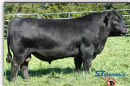
Connealy Clarity, Sire of Lot 8