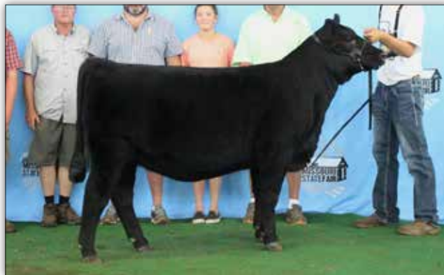
SydGen II Princess 8665, Donor of Lot 25 as a calf