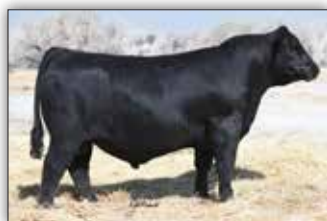
Byergo Colonel G14, Maternal brother to Lot 10 & Dam of Lot 11