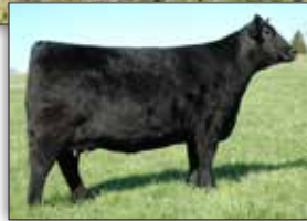
Champion Hill Emblynette 8674 , Dam of Lot 5