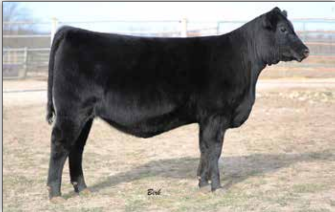
Valley Oaks Bess 0042, Lot 41