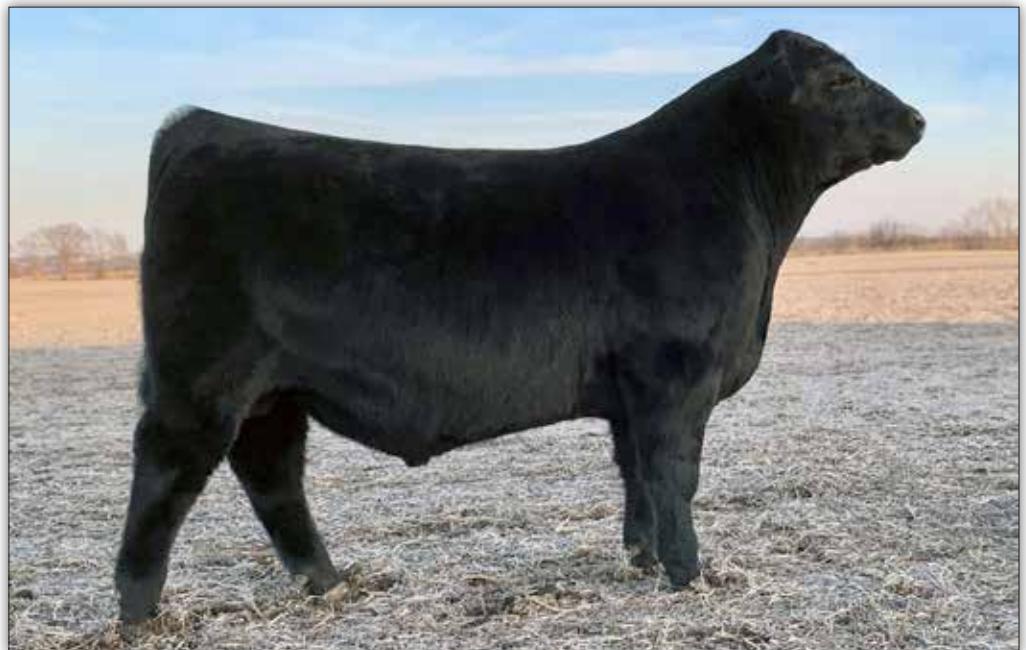
J4 Best In Class 905, Lot 23