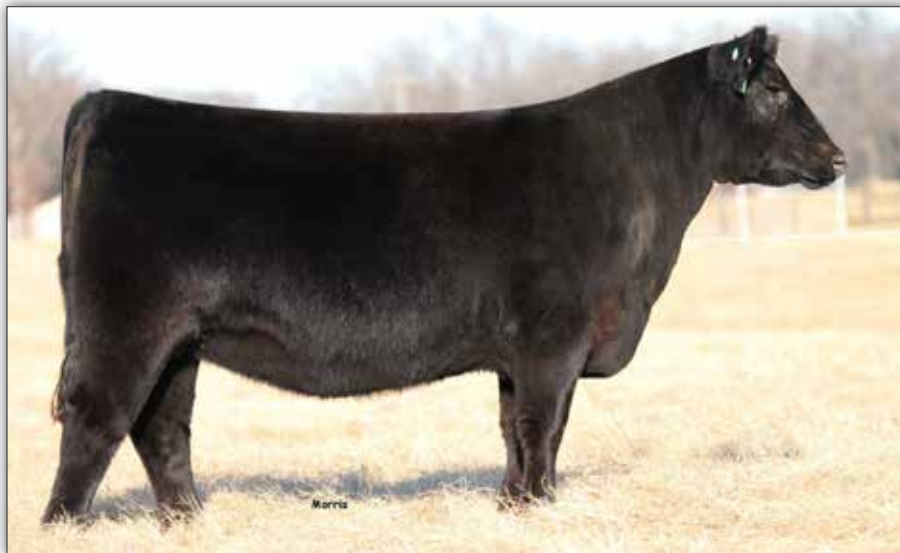
Meyer Rosemary Faith 999, Lot 36

Meyer Rosemary Faith 999 was selected directly out of the Meyer Cattle Co. replacement female pasture. This female offers a carefully chosen pedigree that combines calving ease, high carcass merit and phenotypically pleasing cattle. "999" is tailor made to raise Show-Me-Select qualifying bulls to fit the state's commercial bull demand and she is sure to inject look that will make her calves easy to find. AI bred to Deer Valley Growth Fund and exposed to EXAR Enhance 8633B.