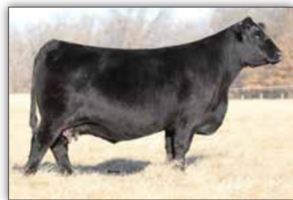
Mature photo of EXAR Forever Lady 6883, Dam of Lot 34