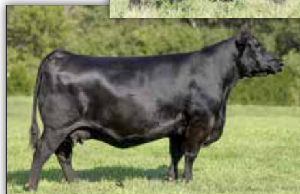
Byergo Clover 150, Donor of Lot 14 & Maternal Sister to Lot 10