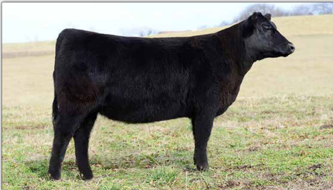
Hat Creek Forever Lady 301H, Lot 26

· This stout made female from the Forever Lady cow family is well patterned in her design and attractive from the profile. Out of the Select Sires bull, Deer Valley Wall Street, this female has an opportunity as a show heifer with great cow potential in the future. Her first calf heifer dam is a perfect bagged female with eye appeal and capacity. 301H's granddam, Birks Forever Lady 100, and great granddam, B&M Forever Lady 294, need no introduction in this sale as they been successful here many times before.