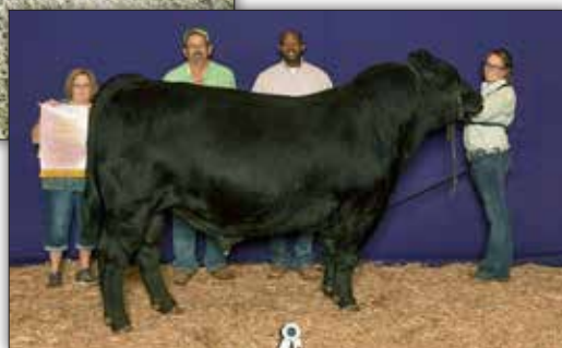
HMM JC Insight 104, Sire of Lot 37 & 38

• This heifer is a very deep bodied female that puts all the parts and pieces together. 607 has the pedigree behind her to perform in the show ring as well as the longevity in the pasture. Stacked with cattle that have been successful in production and the showing, sires include "Insight," 74-51 Sudden Look 1023, B C Lookout 7024, "Hot Lotto," and "Brilliance." An exceptional package from long-time Missouri Angus Association members.