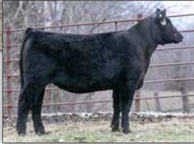
Behlmann Primrose 53H, Lot 2