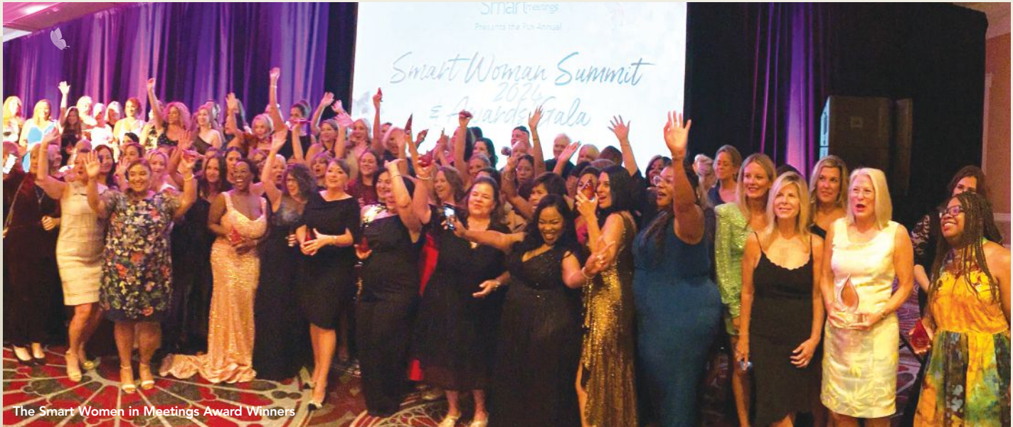
The Smart Women in Meetings Award Winners