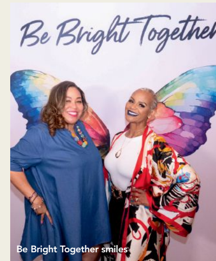
Be Bright Together smiles