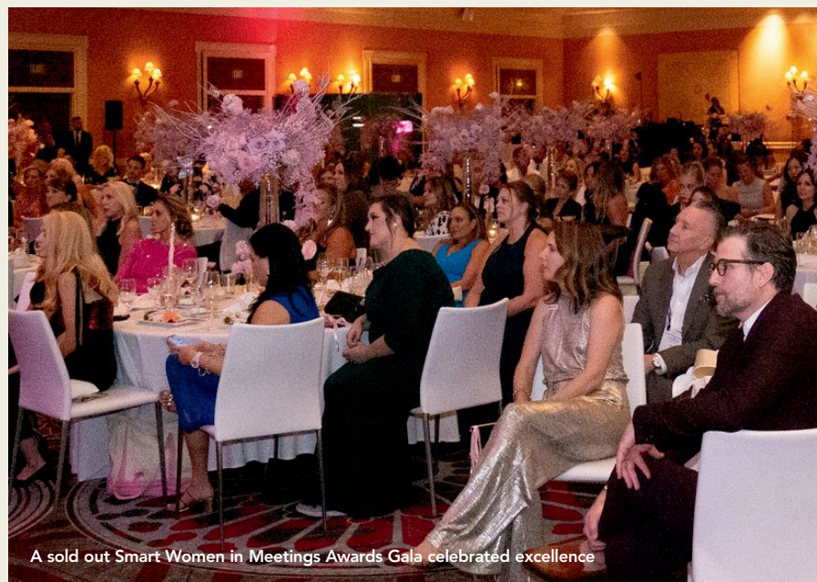
A sold out Smart Women in Meetings Awards Gala celebrated excellence