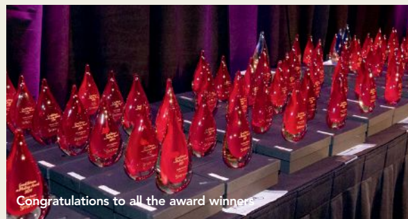
Congratulations to all the award winners