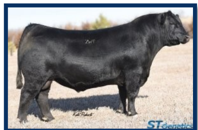
ZWT Summit 6507