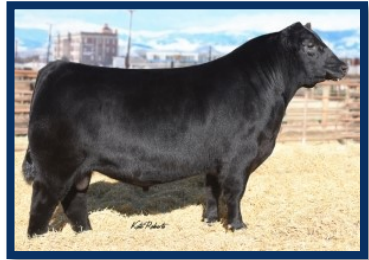
Musgrave Sky High 1535