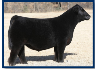
Conley Express 7211