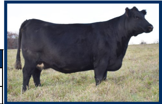
P S Mignonne 889 216