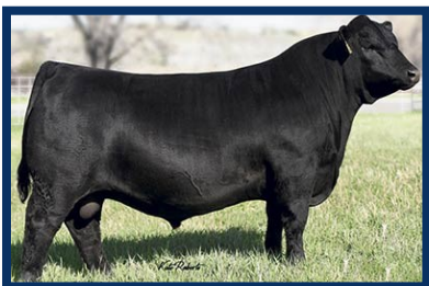
SAV Raindance 6848