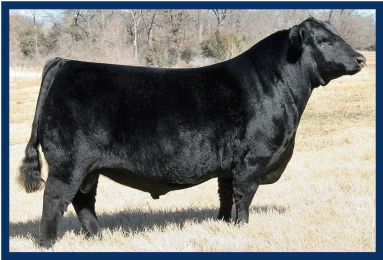
5T Power Chip 4790