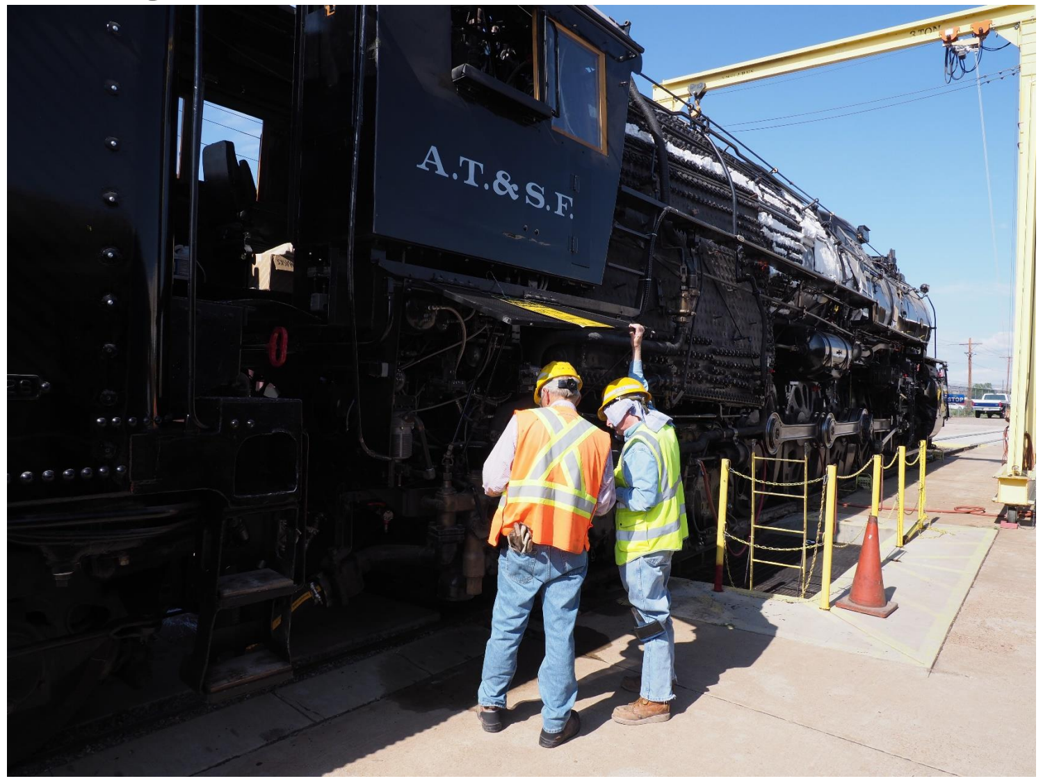
On July 24, 2021 the crew spotted the 2926 with firebox over the pit. After valve line up and lubrication checks it was time to proceed with fire up.

Save the day September 25, 2021. The Annual Free Open House from 9AM to 5PM will be better than ever. See the website www.2926.us for a flyer you can use to invite your friends to the party.