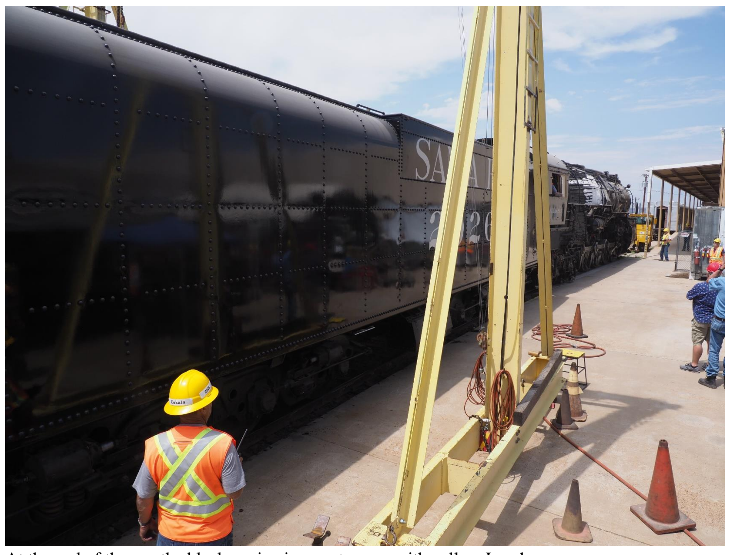
At the end of the run the black engine is nose to nose with yellow Lurch.

On Saturday July 17, 2021 4,000 gallons of water were loaded into the tender with treatment by chemist Roger Jutte. On Wednesday July 21, 2021 a long day of work completed the loading of 8,000 gallons of water into the boiler and 2,000 gallons of fuel oil in the tender.