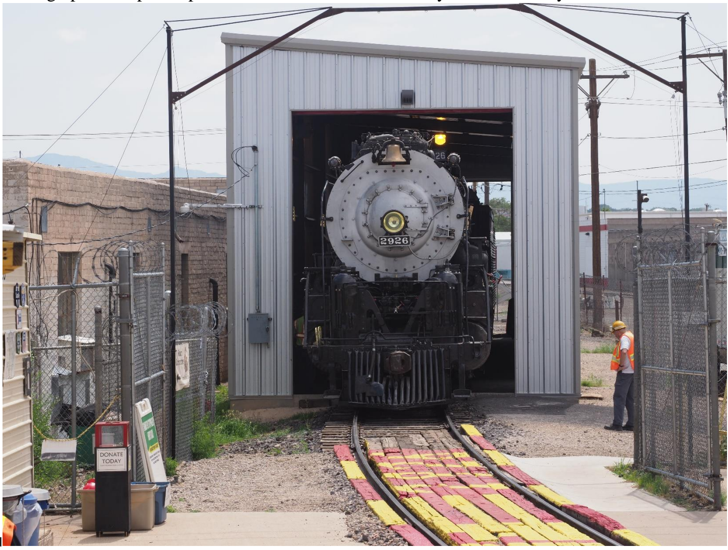
AT&SF 2926 ready to roll. A blast of compressed air from the cylinder cocks and she is off.