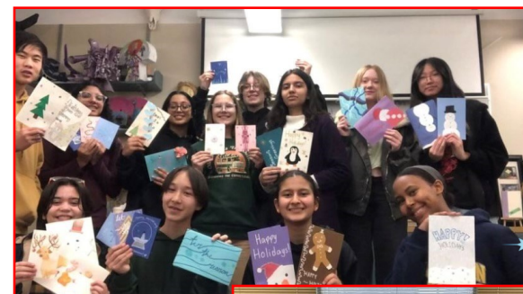
Delview Leos Club

Thank you for your compassion, your empathy, and your unwavering commitment to making a difference in the lives of others. Your actions have left an indelible mark of kindness, and we are deeply grateful for your selfless dedication to spreading holiday cheer.