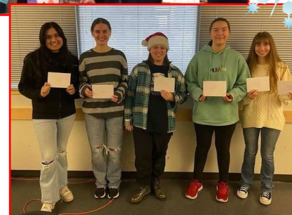
Centennial Writers Society