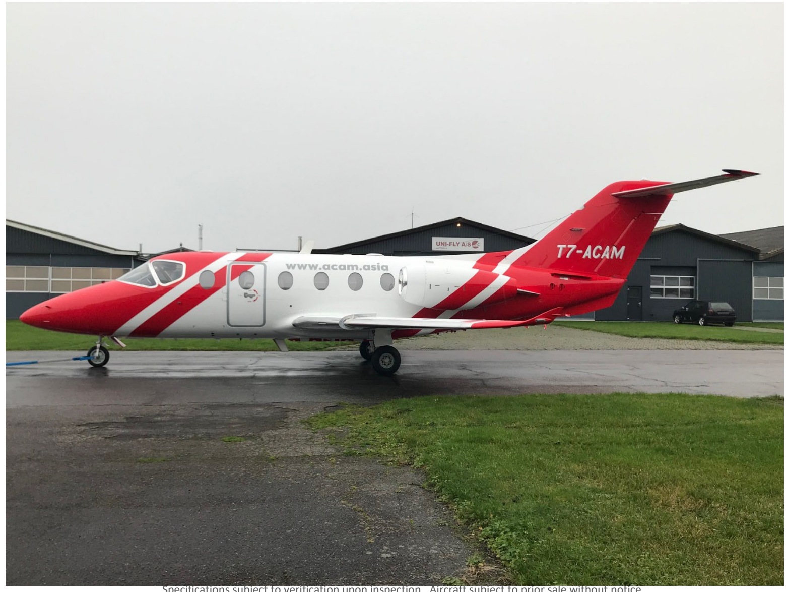
Specifications subject to verification upon inspection. Aircraft subject to prior sale without notice.