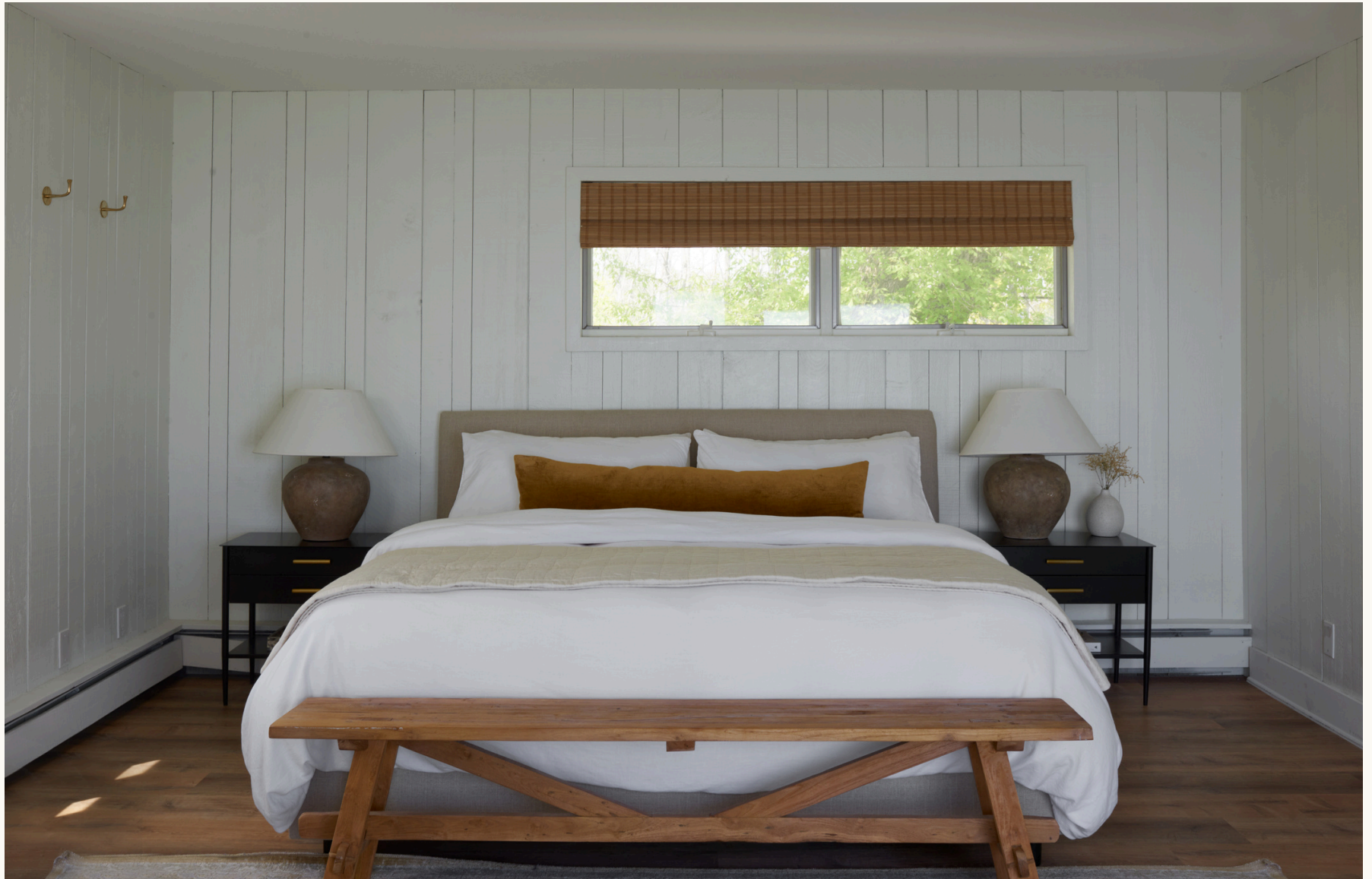
ASHER PRIMARY BEDROOM