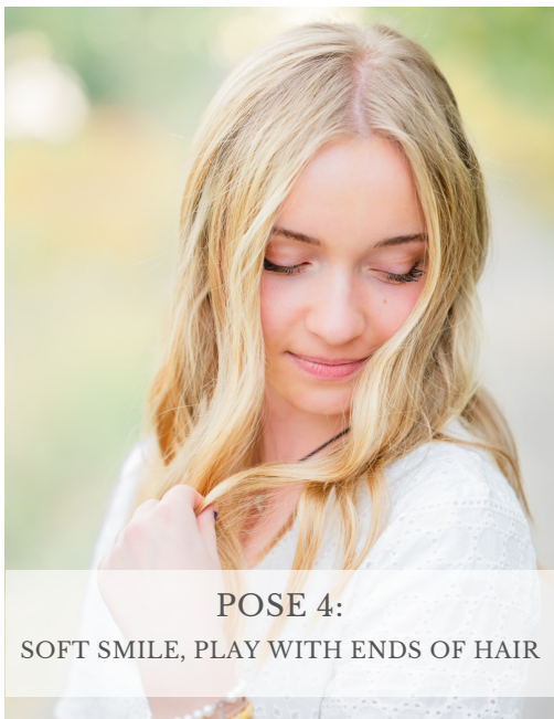
POSE 4: SOFT SMILE, PLAY WITH ENDS OF HAIR