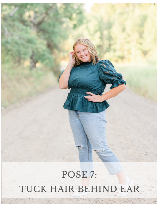
POSE 7: TUCK HAIR BEHIND EAR