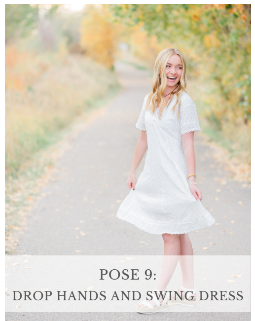
POSE 9: DROP HANDS AND SWING DRESS