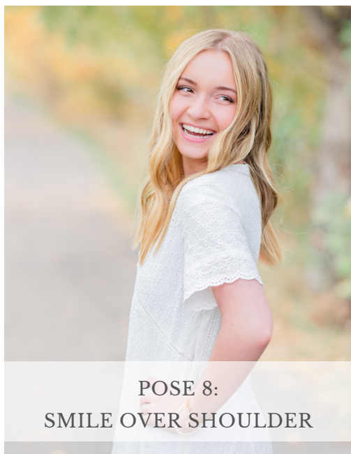
POSE 8: SMILE OVER SHOULDER