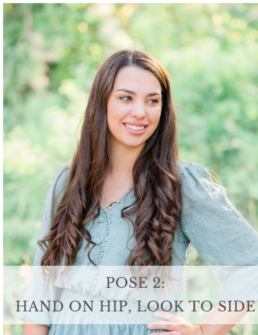
POSE 2: HAND ON HIP, LOOK TO SIDE