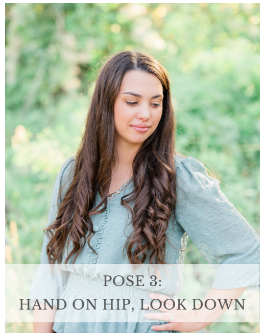
POSE 3: HAND ON HIP, LOOK DOWN