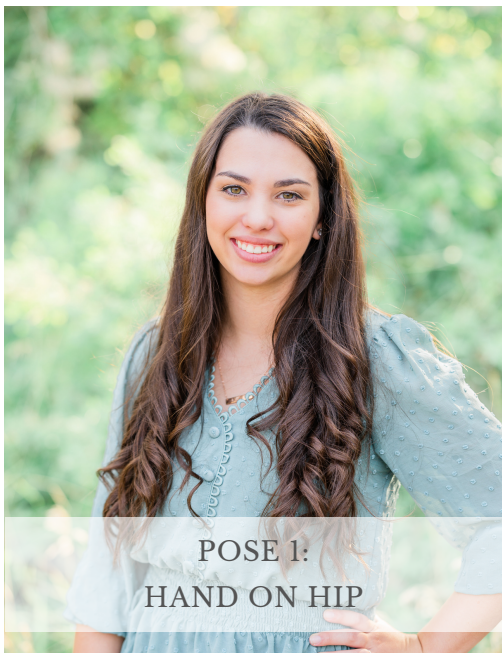
POSE 1: HAND ON HIP