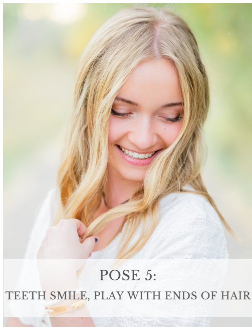
POSE 5: TEETH SMILE, PLAY WITH ENDS OF HAIR