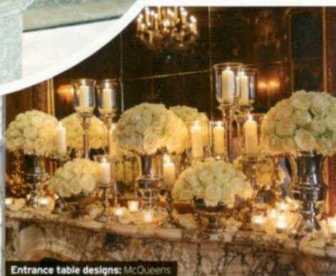
Entrance table designs: McQueens