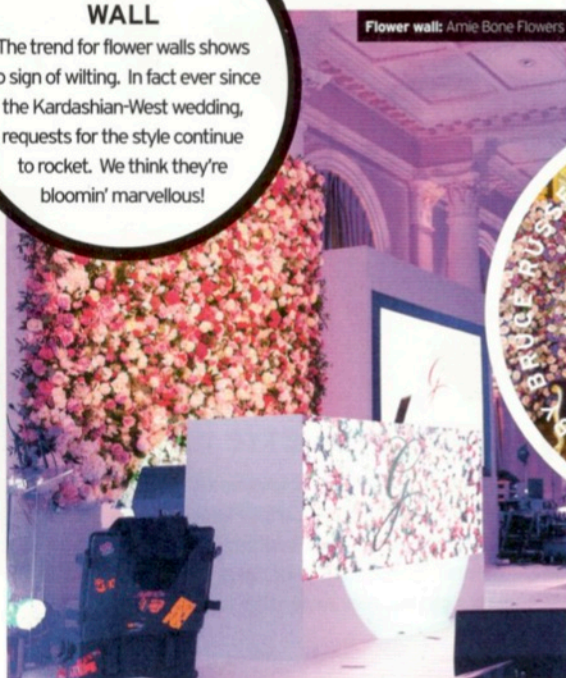
Flower wall: Amie Bone Flowers

The trend for flower walls shows no sign of wilting. In fact ever since the Kardashian-West wedding, requests for the style continue to rocket. We think they're bloomin' marvellous!