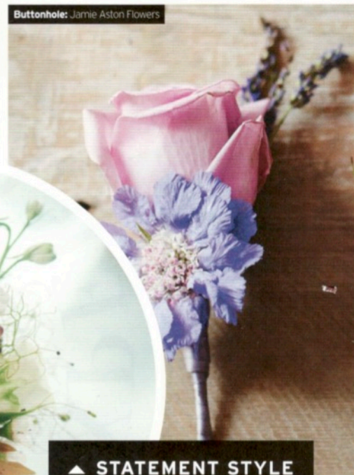
Boutonniere: Jamie Aston Flowers