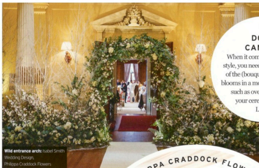
Wild entrance arch: Isabel Smith Wedding Design, Philippa Craddock Flowers