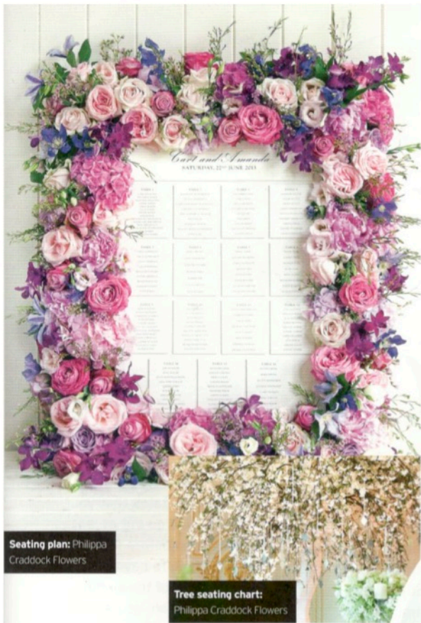
Seating plan: Philippa Craddock Flowers