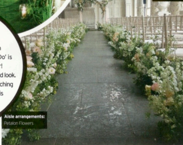
Aisle arrangements: Petalon Flowers

A petal-strewn aisle is one thing, but bringing in trees to line your route to 'I Do' is something else altogether! We adore this magical wonderland look. Add candles, tall grass and a matching green carpet, and the effect is positively bewitching.