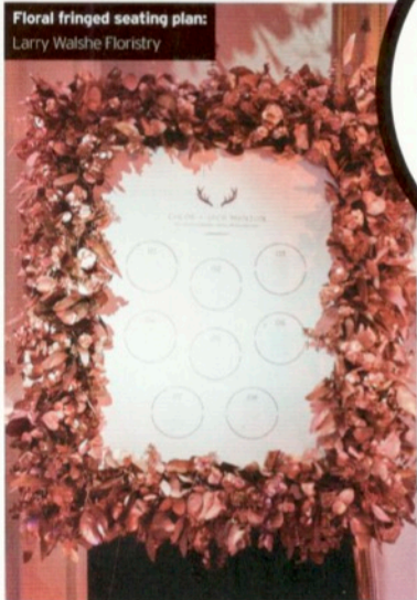
Floral fringed seating plan: Larry Walshe Floristry

Frame your seating chart with flowers and foliage in your colour scheme or let flowers take centre stage by hanging table cards from the branches of a tree with ribbon, in the style of Philippa Craddock (pictured above).