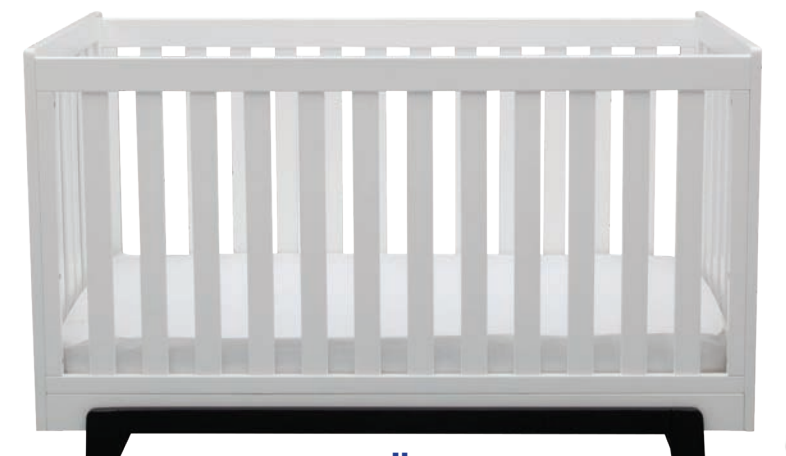
crib Delta Children Aster 54"W x 31"D x 36"H wood crib in Bianca white and ebony, $240, walmart.com