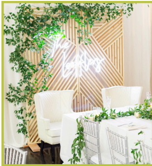
Wood Panel Backdrop