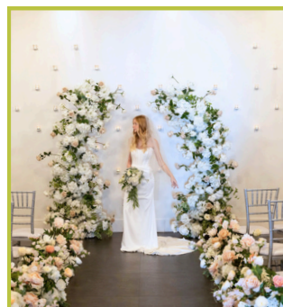
(2) Floral Pillars