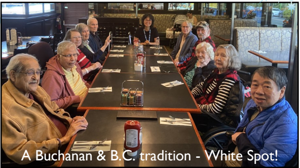
A Buchanan & B.C. tradition - White Spot!