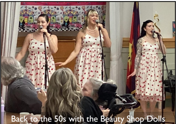
Back to the 50s with the Beauty Shop Dolls