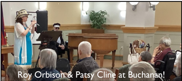
Roy Orbison & Patsy Cline at Buchanan!