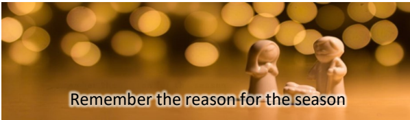
Remember the reason for the season