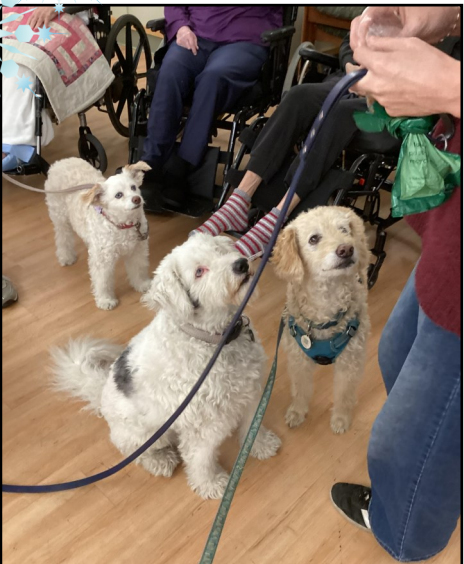
"Going to the dogs" - in a good way