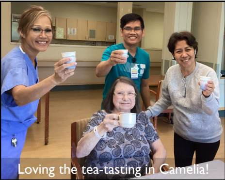
Loving the tea-tasting in Camelia!