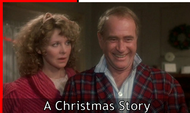
A Christmas Story

In those moments when we move beyond our chronic selfishness to focus on those we love, we discover the truth in what Jesus said: "it is more blessed to give than to receive".