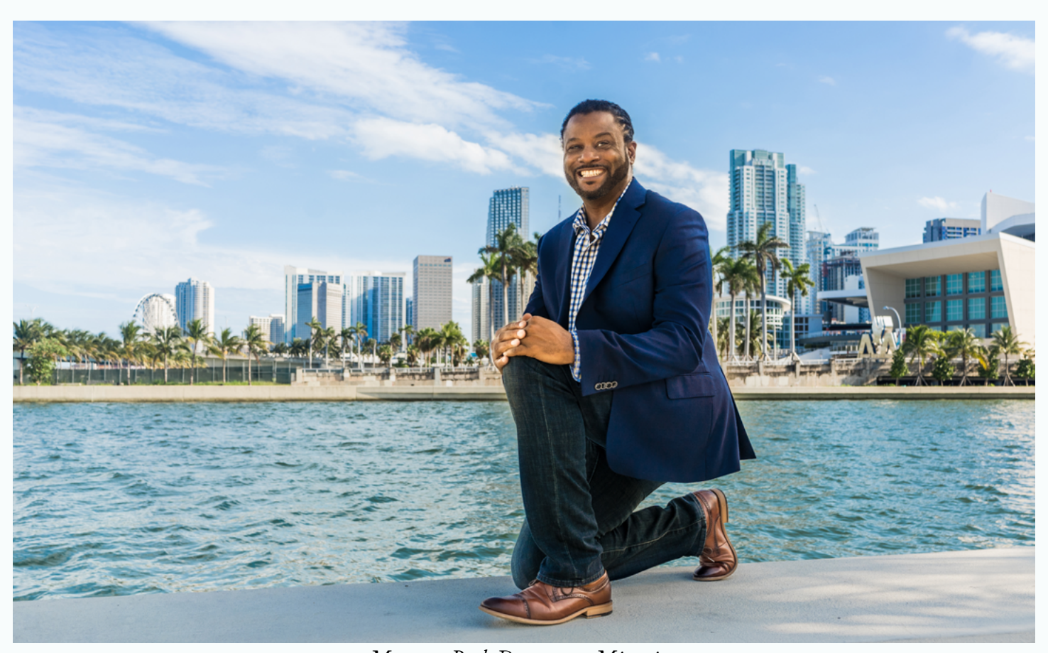
Museum Park Downtown Miami