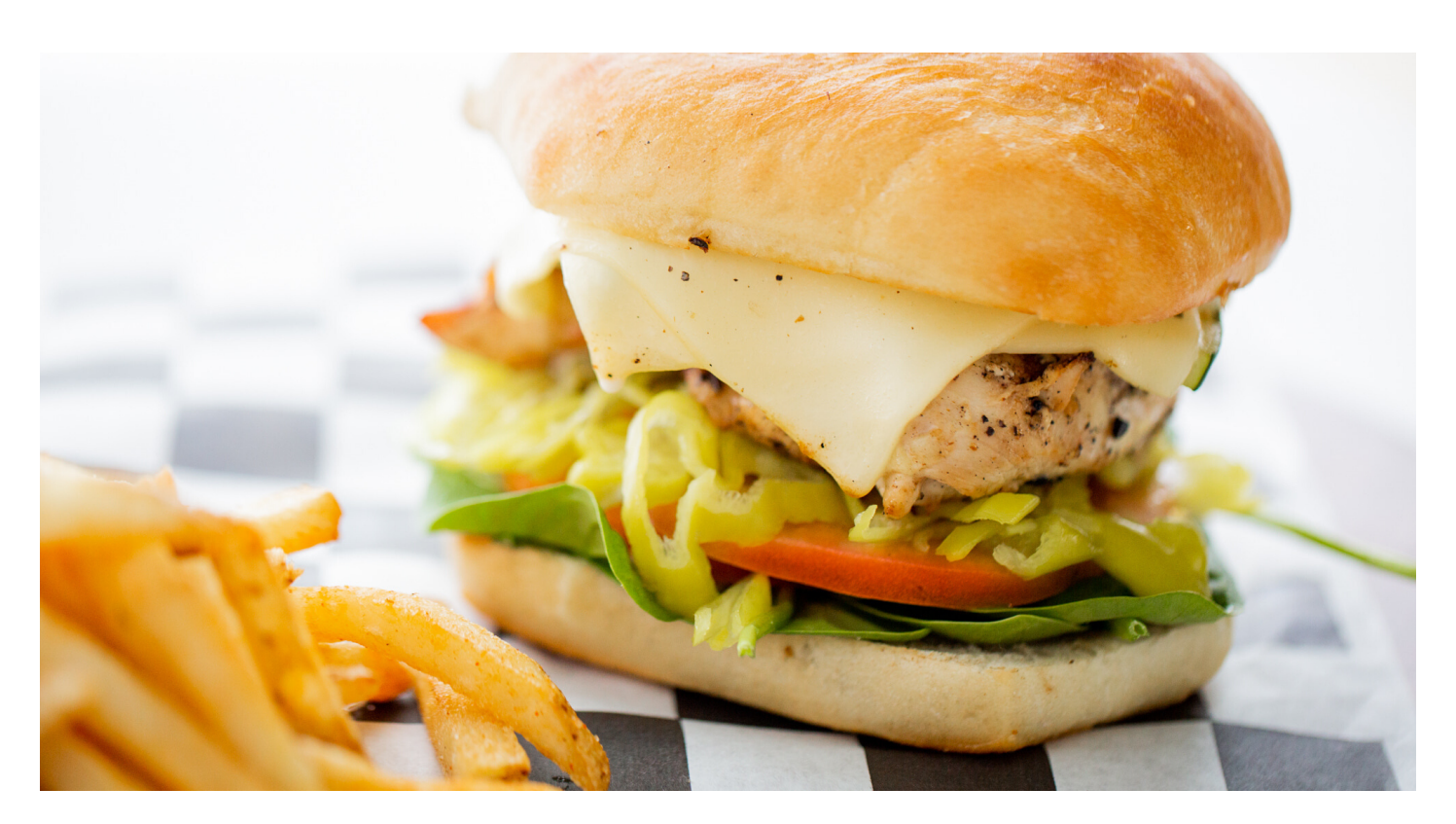
ITALIAN CHICKEN SANDWICH