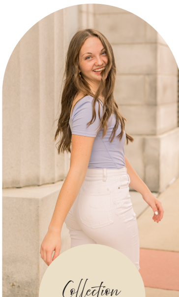
Collection No. 2