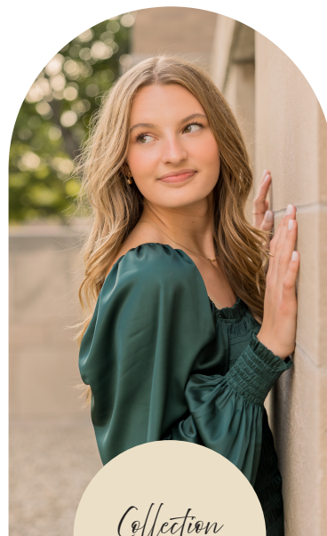
Collection No. 3

The perfect session for those that know the location type they want & are happy staying in one spot. Excited to explore the park for your session? Let's do it! Aren't looking to have a natural backdrop but want the city feel? We can go downtown! It's totally your call. Grab your 2 outfits and I'll meet you there!