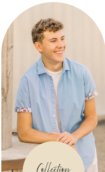
Collection No. 1