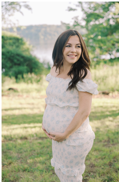
Worth Collective S