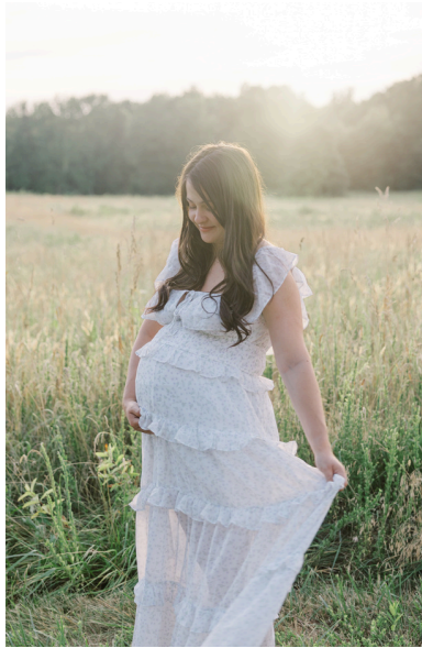
Worth Collective L