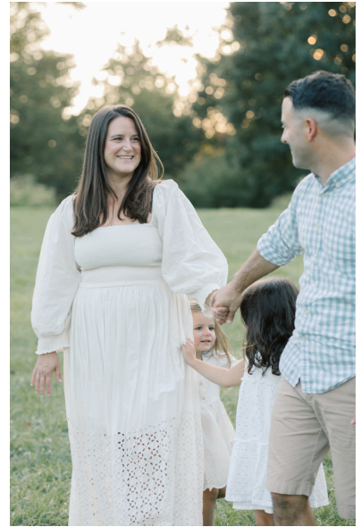
Free People L