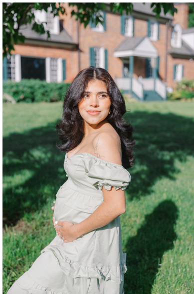
Worth Collective M