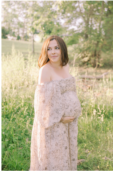
Worth Collective M