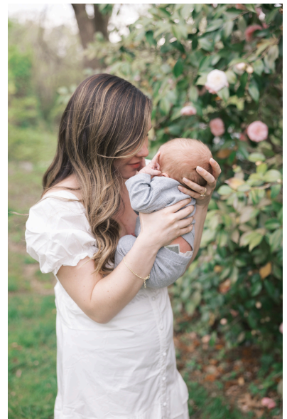
Worth Collective M