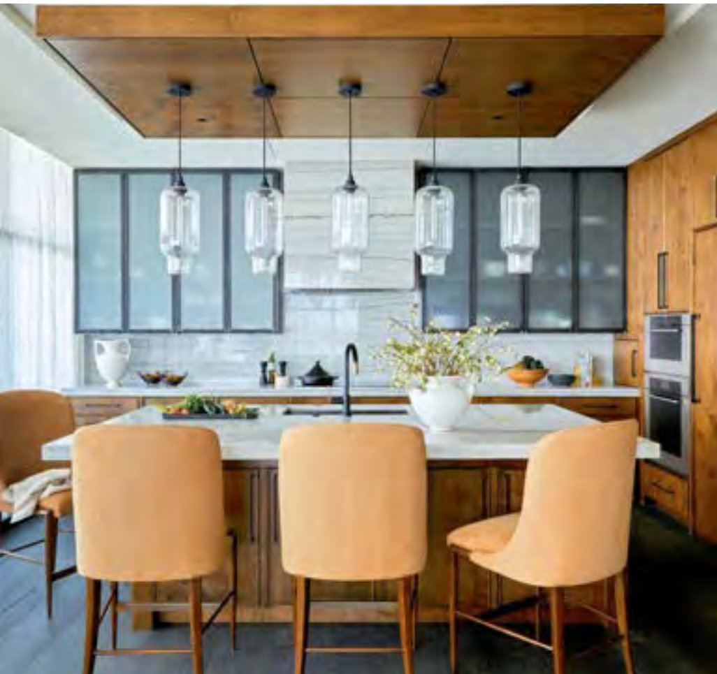
❏ A cluster of five hand-blown glass pendant lights above the island deliver texture without distracting from the cabinets and hood.